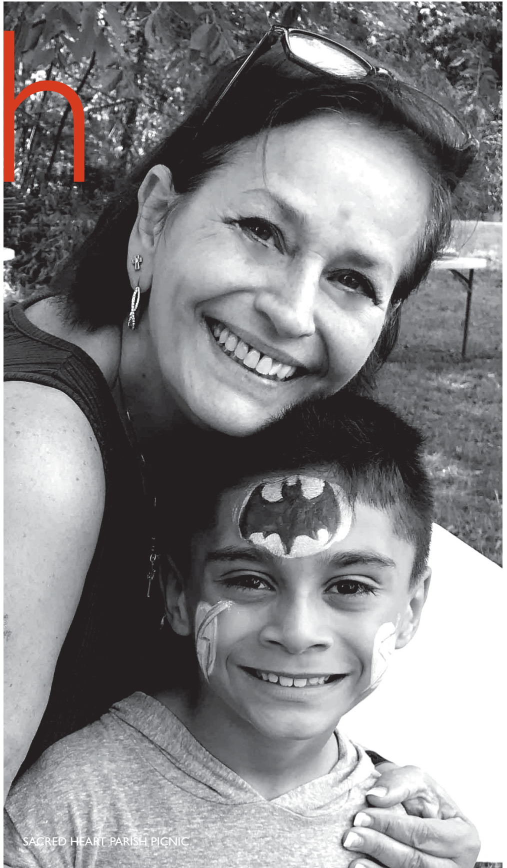
SACRED HEART PARISH PICNIC

414 Haviland Drive Patterson, NY 12563 845-279-4832