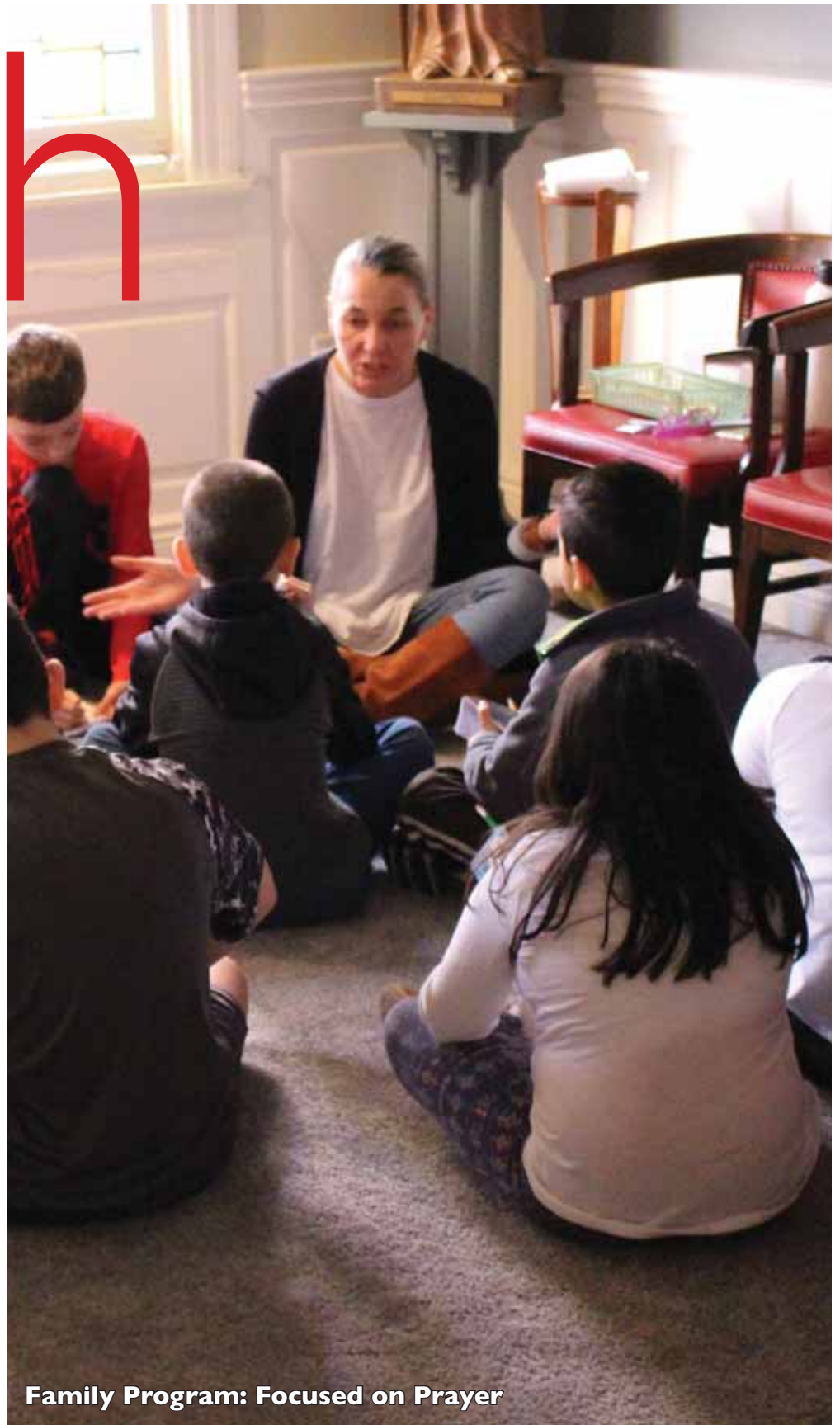
Family Program: Focused on Prayer

414 Haviland Drive Patterson, NY 12563 845-279-4832