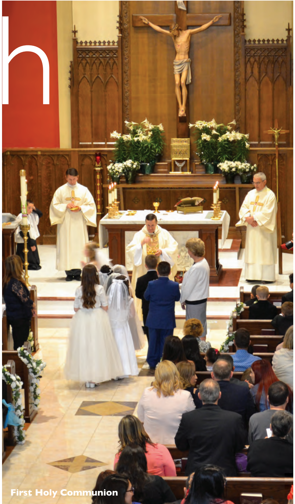
First Holy Communion