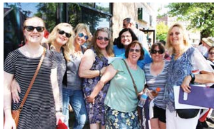
Parishioners waiting for procession to begin

There are many passages in the history of the people of God where pilgrimages took place. We could mention the exodus of the Israelites, the Holy Family traveling to Jerusalem every year for the feast of Passover, or the entrance of Jesus into Jerusalem on 'Palm Sunday.' Walking with Jesus along the streets of Brewster reminded me of the passage where Peter denied Jesus three times. Luke 22:54-62 Peter followed Jesus to the high priest's house while trying to not be noticed. Instead, at every step, he was recognized as a follower of Jesus. The first lady said to him "You are His follower," the second person said to Peter, "You were with Him, your accent gives you away". The third time someone else insisted, "You are certainly one of them, for you too are Galilean!" Everyone knew he was one of Jesus's disciples, for he had been seen with Him.