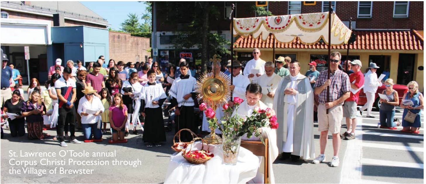
St. Lawrence O'Toole annual Corpus Christi Procession through the Village of Brewster