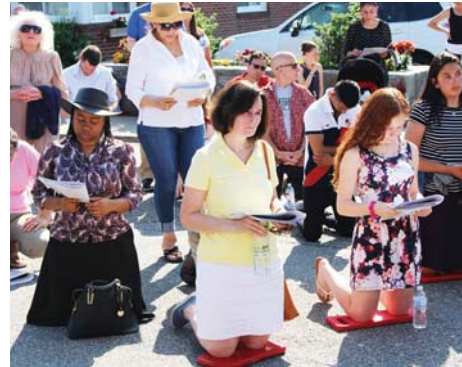
People kneeling at one of the stations during the procession

For Peter, the rooster crowed and that was the signal that he had been given three chances to either accept being 'one of those who follow Jesus', or being 'one of those who don't follow Jesus.' For Peter a rooster gave him the signal he needed. What would our signal be?