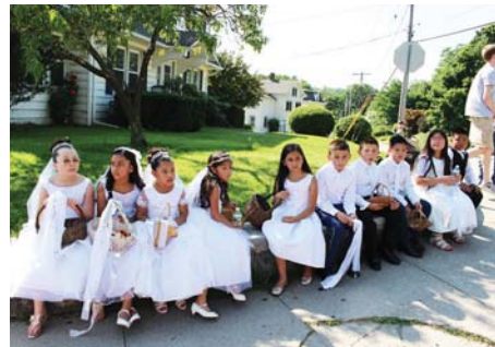
First Communion children who lead the procession

in the most Holy Sacrament of the Eucharist.