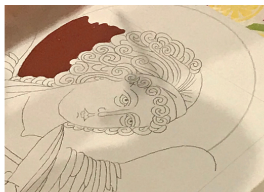
Red clay being applied before gold leaf.