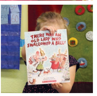
Advent Reindeer holds love