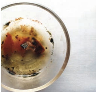
Argentine Host transforms August 26, 1996