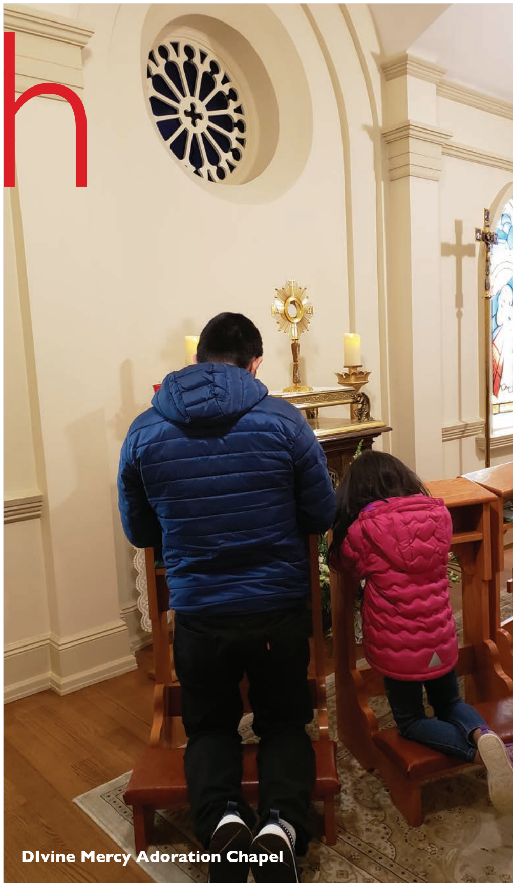
Divine Mercy Adoration Chapel