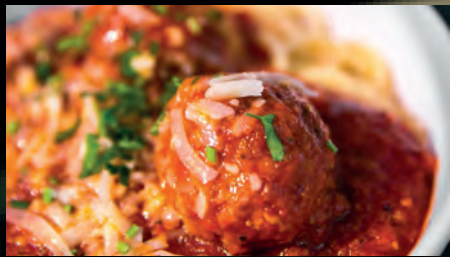
Meals for families in need