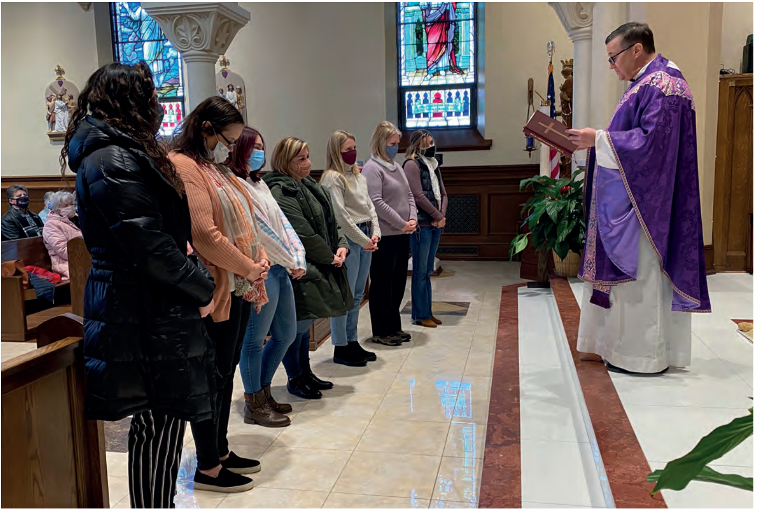
On Sunday, February 21, several candidates to become Catholic are blessed at the “Rite of Election”