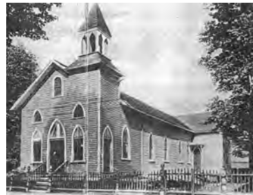
St. Lawrence O'Toole Church, bell tower was added.

A small wooden building on Prospect Street was converted into a Church in 1871 and dedicated to the Irish saint Lawrence O'Toole, a bishop from the 11th Century. How proud those first parishioners must have been to found their own Church!