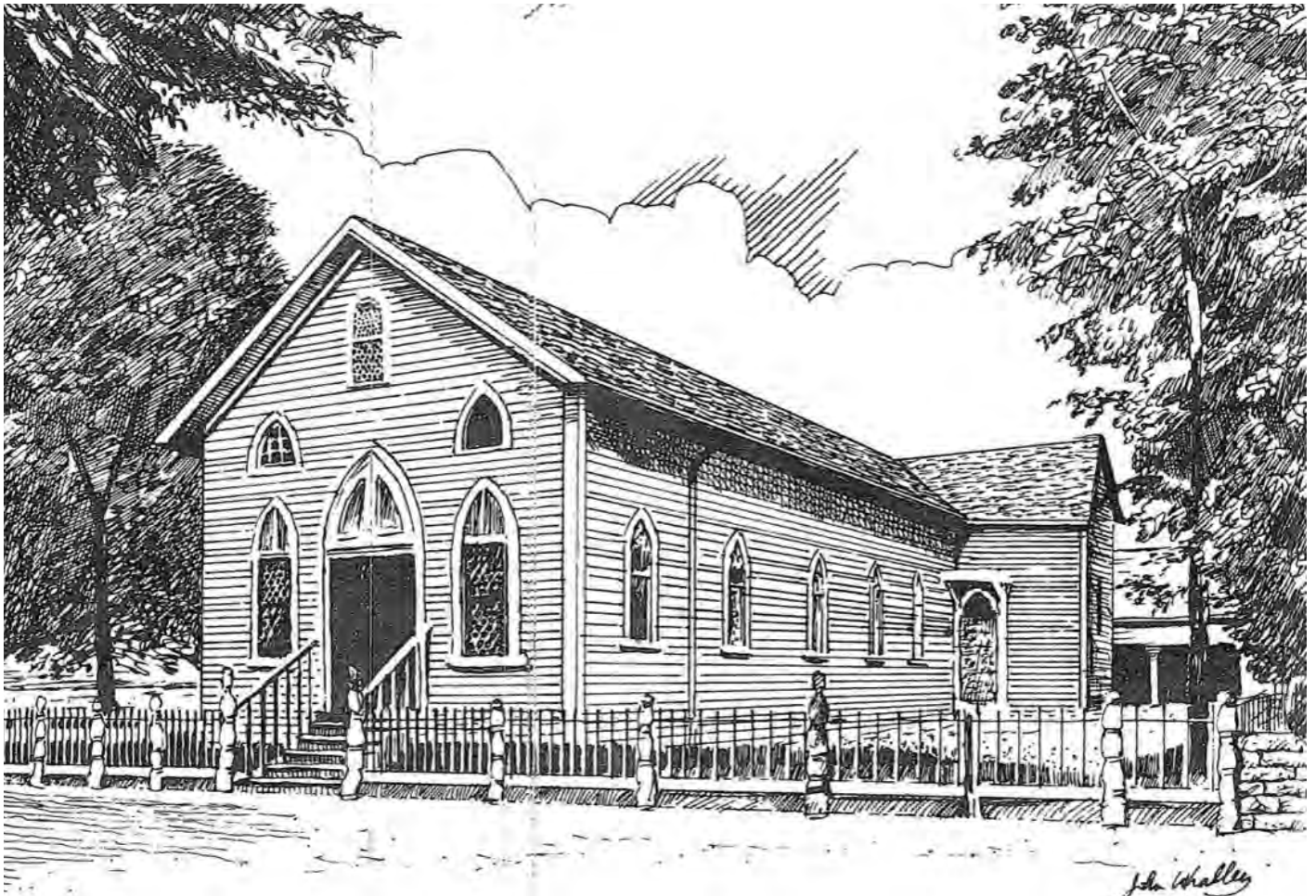
Original wooden church on Prospect Street