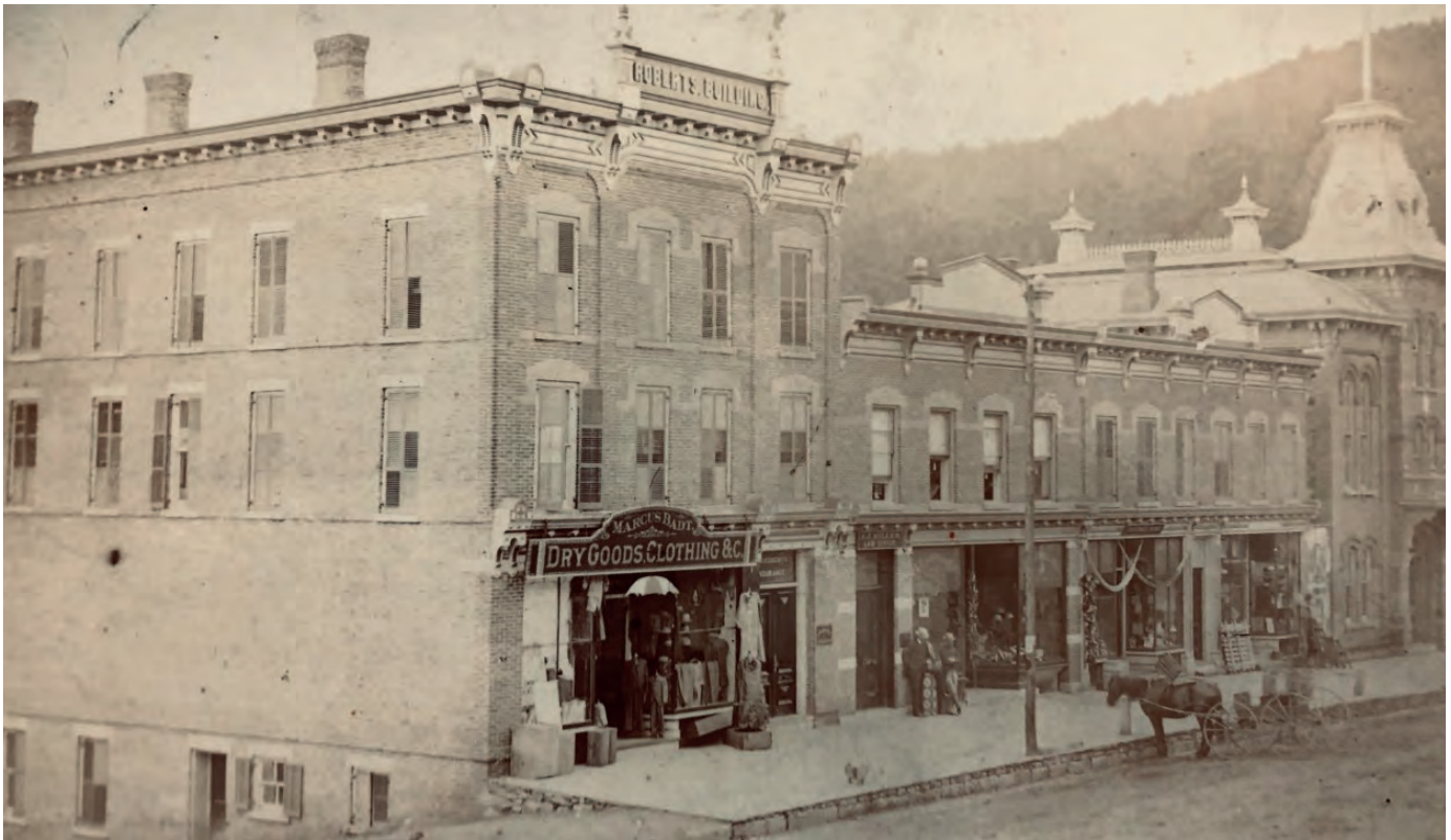
Brewster, approximately 1890. The Town Hall was to the right. Brewster was growing and St. Lawrence was part of its growth.