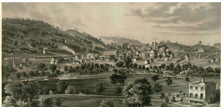
View of Brewster, Beers Atlas, 1867