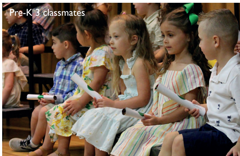
Pre-K 3 classmates