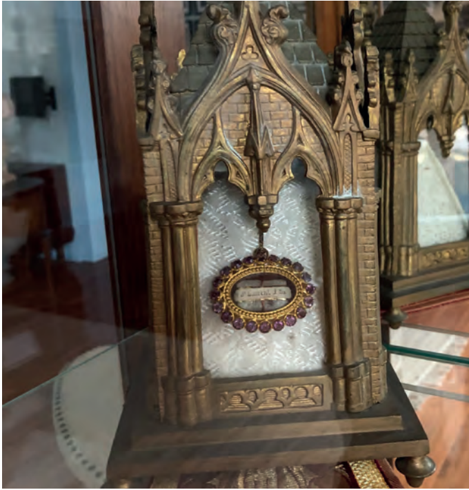
The relic of Saint Lawrence O'Toole from Eu, France