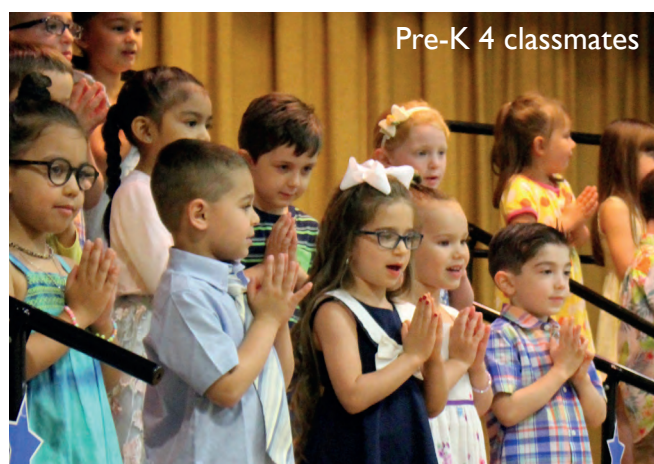
Pre-K 4 classmates