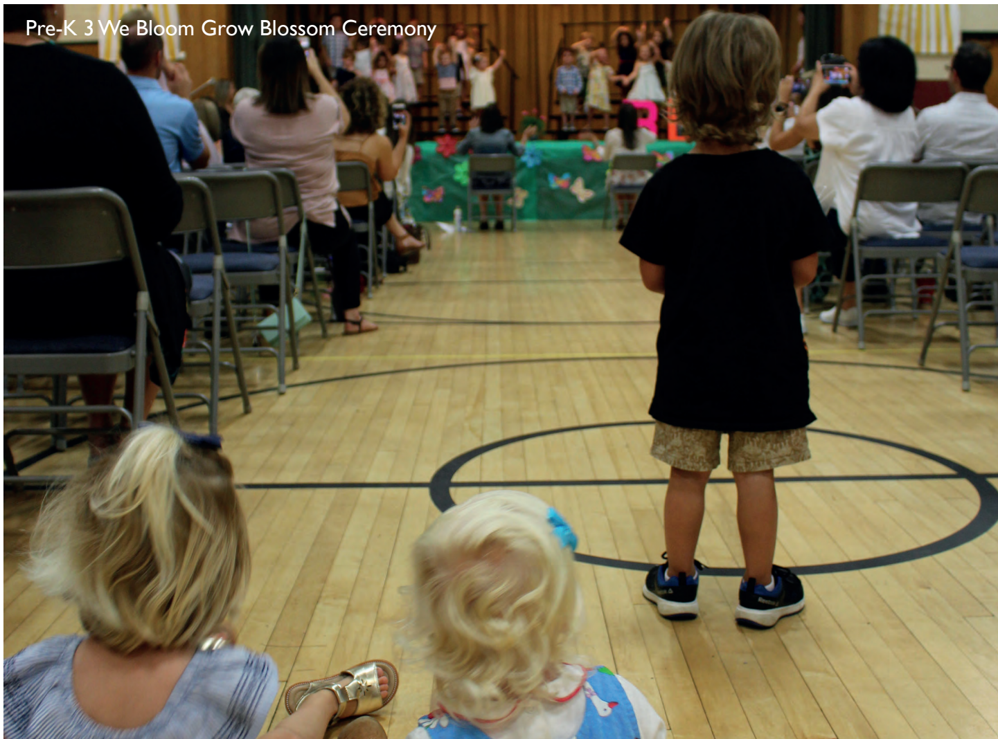
Pre-K 3 We Bloom Grow Blossom Ceremony