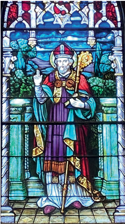
St. Lawrence O'Toole