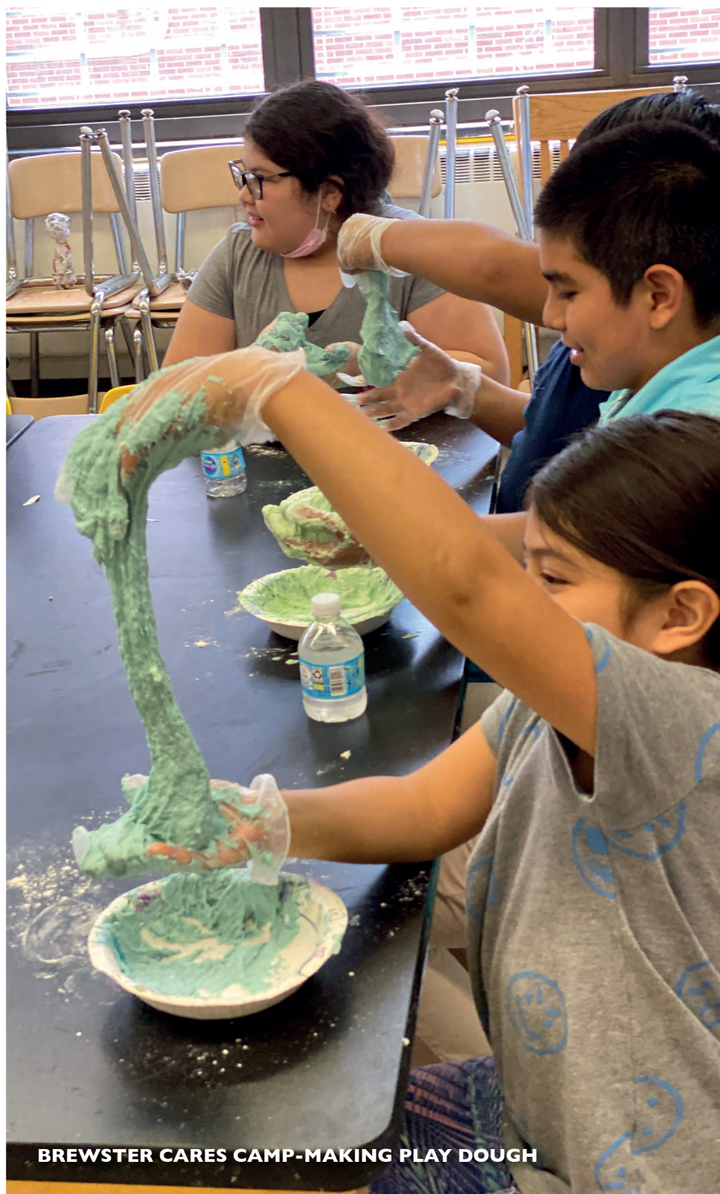
BREWSTER CARES CAMP-MAKING PLAY DOUGH