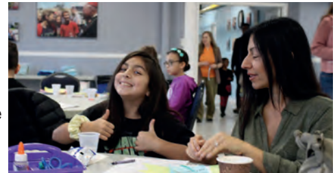
In-person session of the Family Program

You may remember when we started these new programs several years ago, it was because we were convinced there was a better and more effective way to pass on the faith to our young people. We were convinced that kids would embrace the faith if their parents were engaged and were strong believers, so a huge part of the program is empowering parents to teach their own kids.