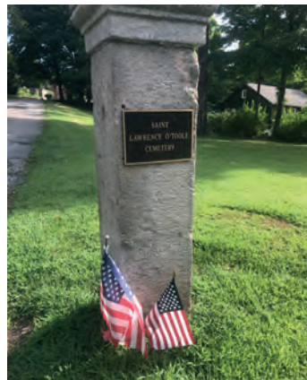
Entrance to St. Lawrence O'Toole Cemetery

In 1893, St. Joseph's church caught fire due to a passing locomotive and burned to the ground. In 1894, it was rebuilt but because it was constructed near a drainage area of the Croton River, the church and the cemetery were moved. In 1902, the chapel and rectory were relocated across Mahopac Avenue. In 1903, the land was purchased (next to Ivandell Cemetery) in Somers for St. Joseph's cemetery. The remains of the church founders and early parishioners were reburied. It's possible the remains of those from Brewster were reburied in St. Lawrence cemetery. That would answer the question of why we have headstones that pre-date the cemetery itself.