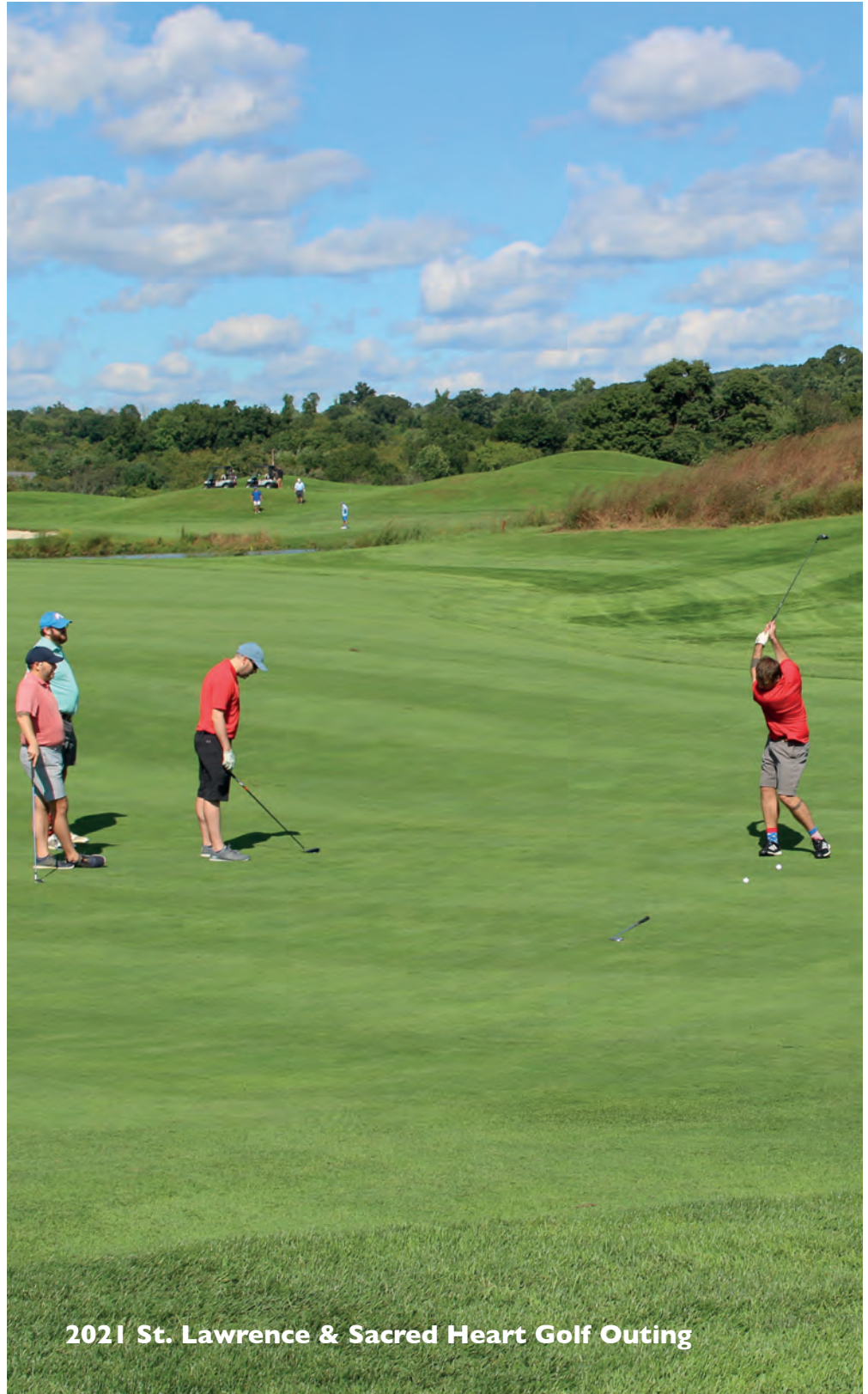
2021 St. Lawrence & Sacred Heart Golf Outing