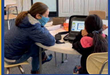
Tutoring grades 1-5

A little from you makes a big difference!