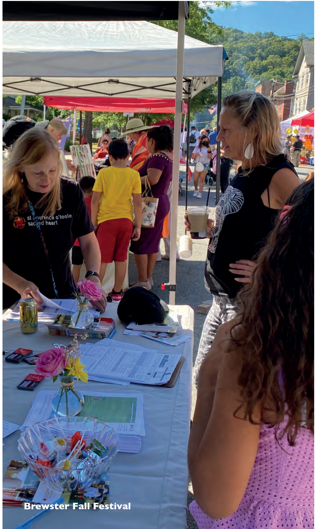
Brewster Fall Festival