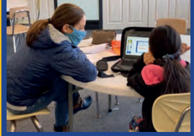
Tutoring grades 1-5

a Little From You Makes a Big DIFFERENCE!