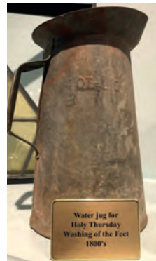
Washing of the Feet from the original church!

tery debt, is buried in a borrowed grave. I thought of Jesus laid in the borrowed tomb of Joseph of Arimathea. Burial in the hallowed ground of a Catholic cemetery reminds us of the burial of Jesus and expresses hope in our own resurrection when body and soul will be reunited.