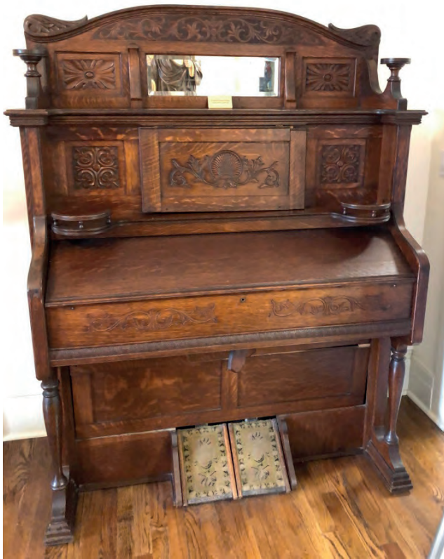
Original pump organ for the wooden church