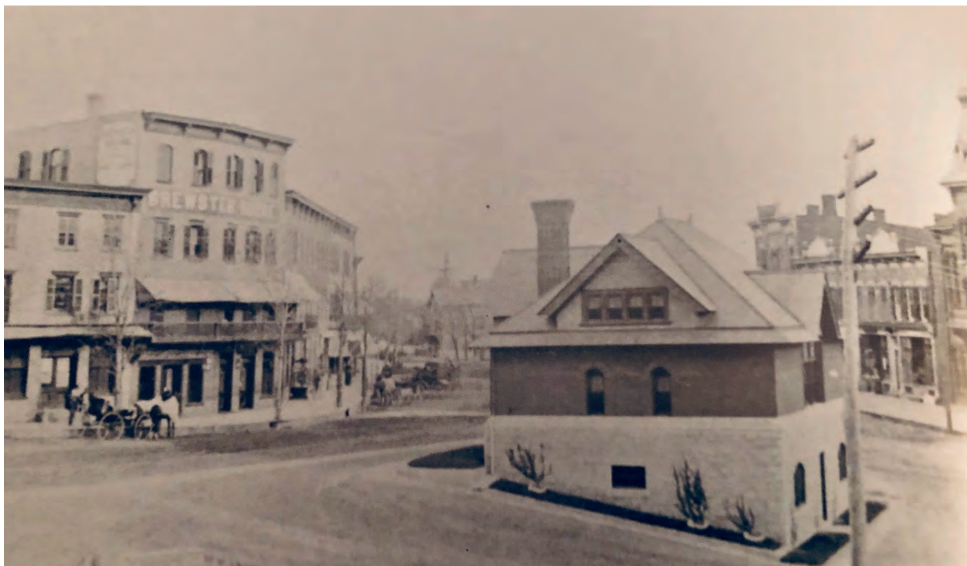
The Village of Brewster in the late 1880s with the First National Bank in the foreground.