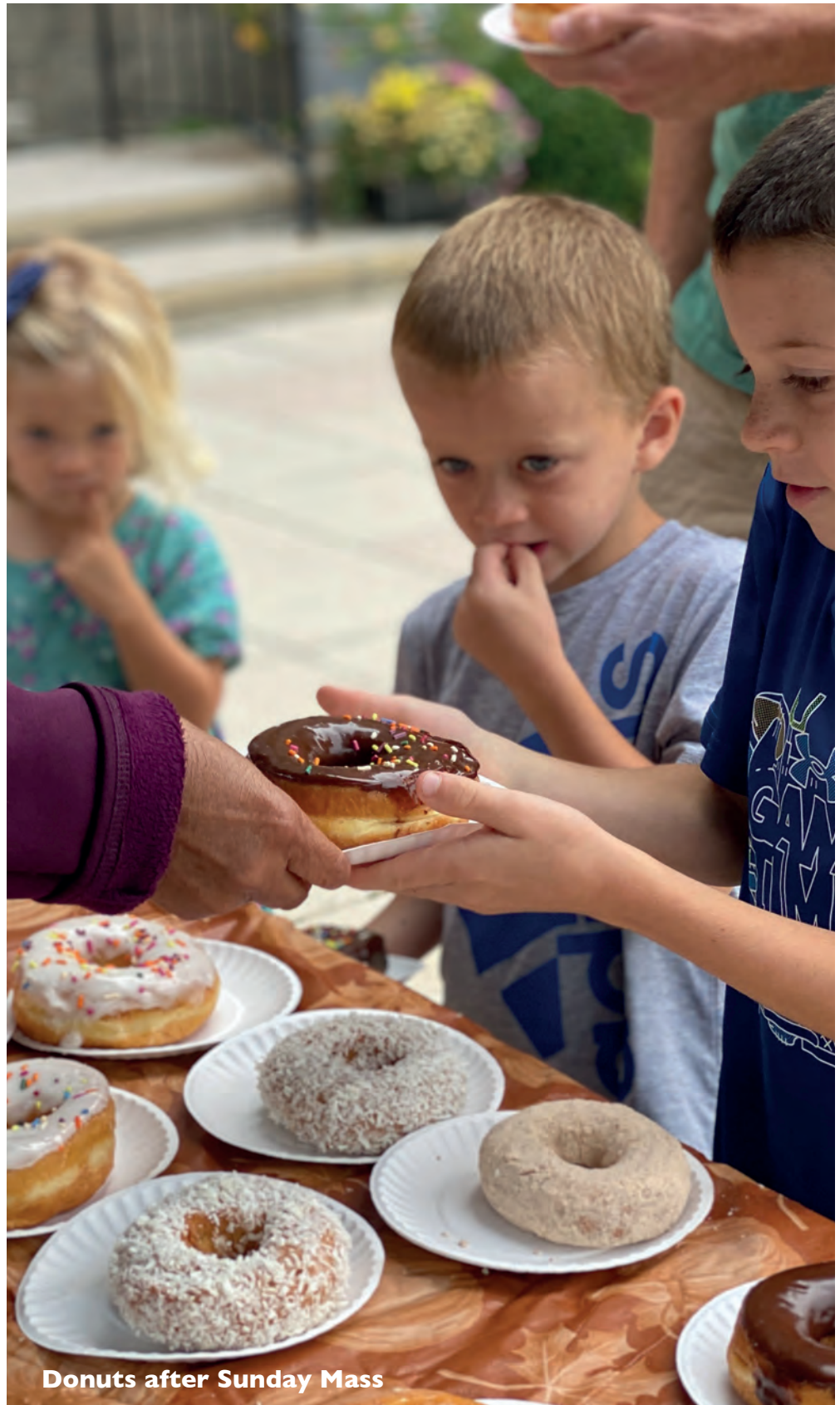
Donuts after Sunday Mass