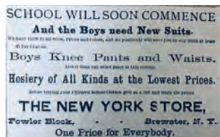
Ad for The New York Store