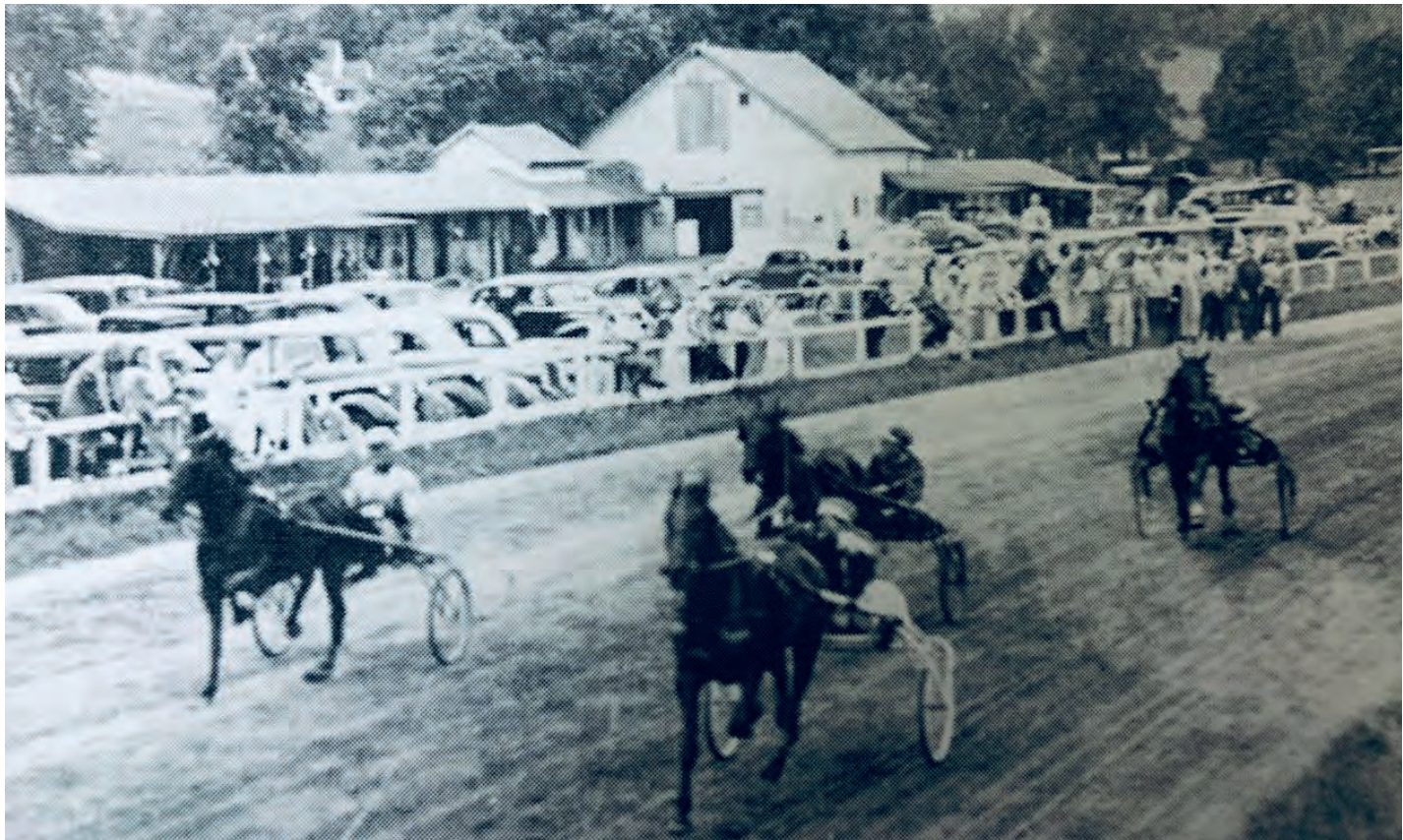
Trotting or Harness Racing at the County Fair in Carmel, NY 1800s.