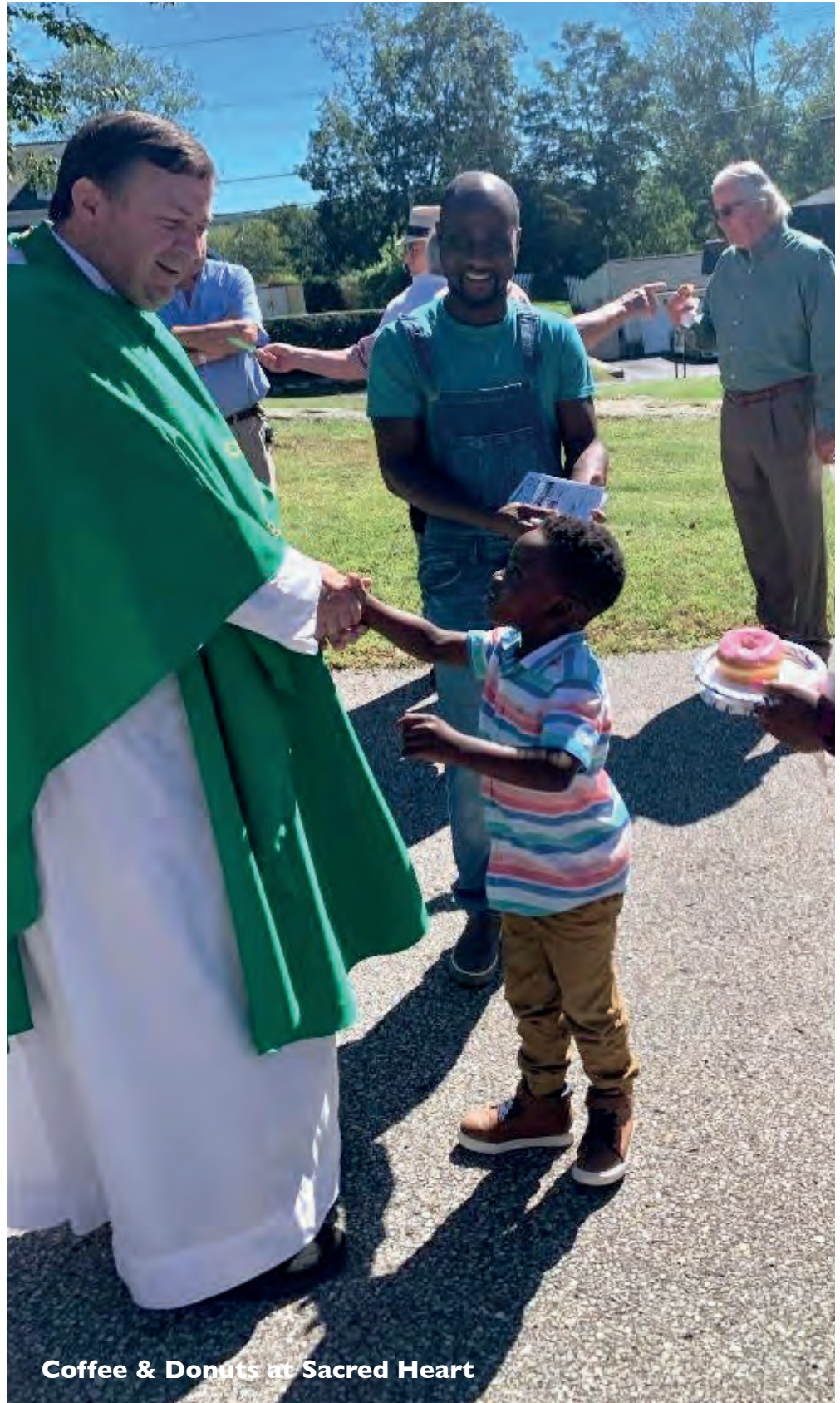
Coffee & Donuts at Sacred Heart