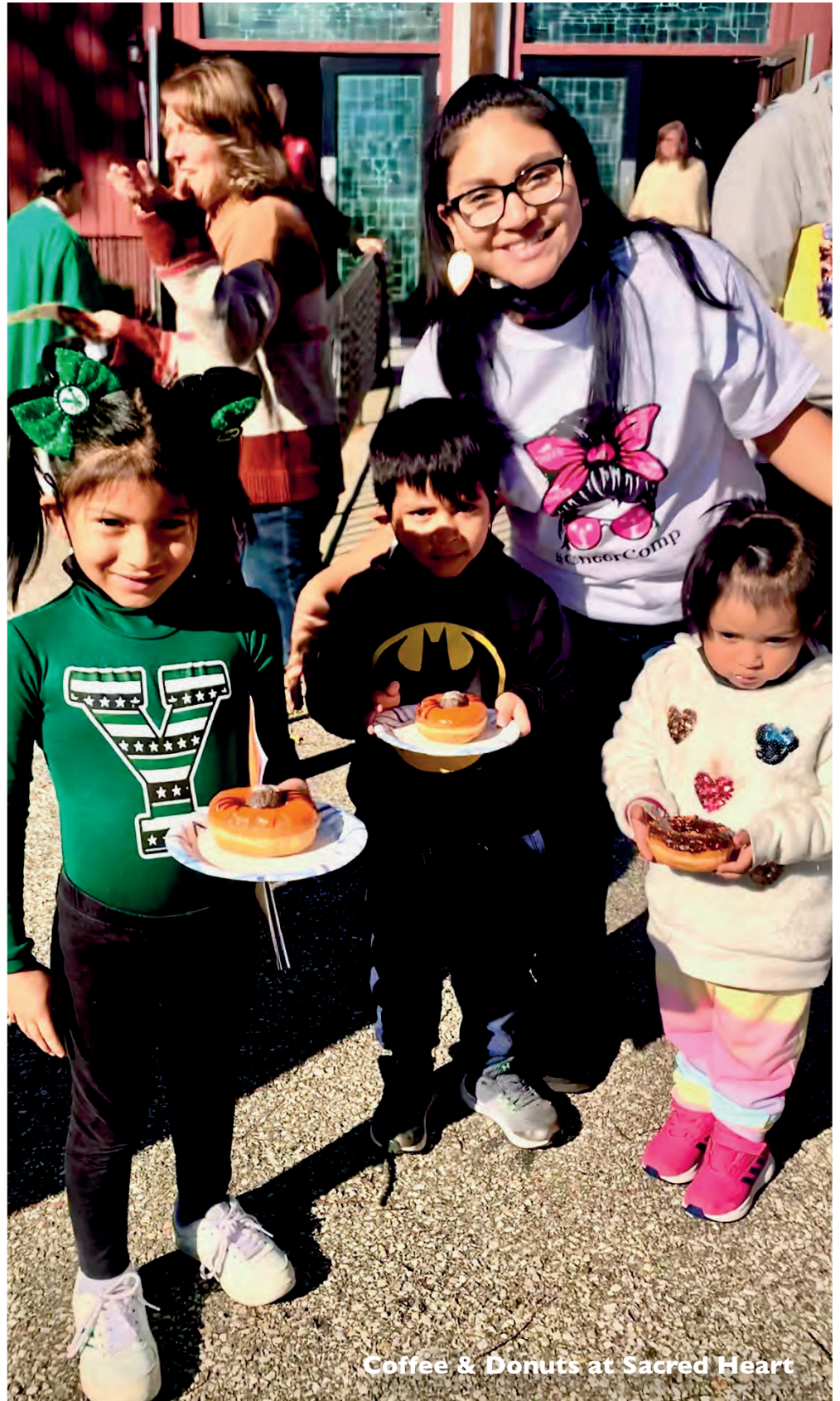
Coffee & Donuts at Sacred Heart