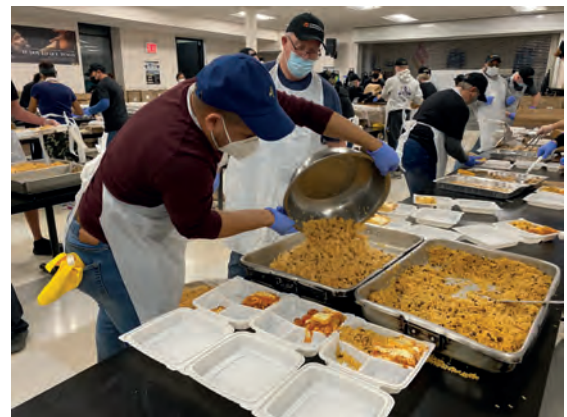
Packing meals at St. Anthony of Padua on Thanksgiving day.