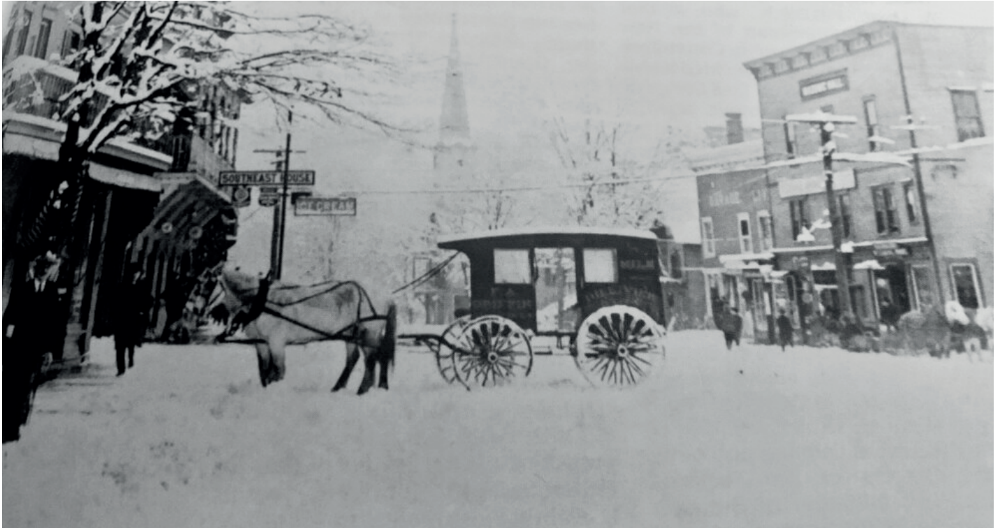
Main Street in Brewster during 1905 blizzard.