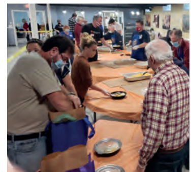
Volunteers helping the Franciscans and Knights of Columbus with packing Thanksgiving meals for the homebound.