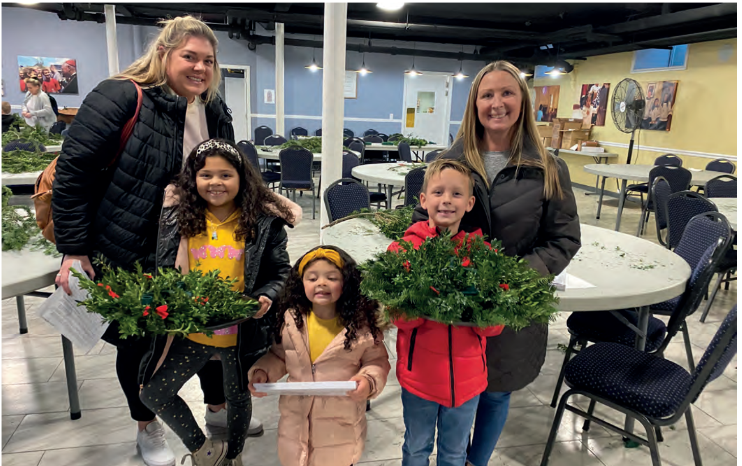
Advent Wreath Making! Families made seasonal wreaths from boxwood and pine branches. They will be able to light the purple and pink candles throughout the weeks of Advent.

A little from you makes a big difference.