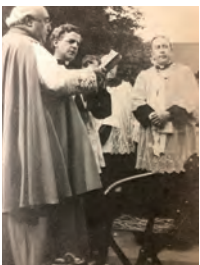
Blessing of the cornerstone