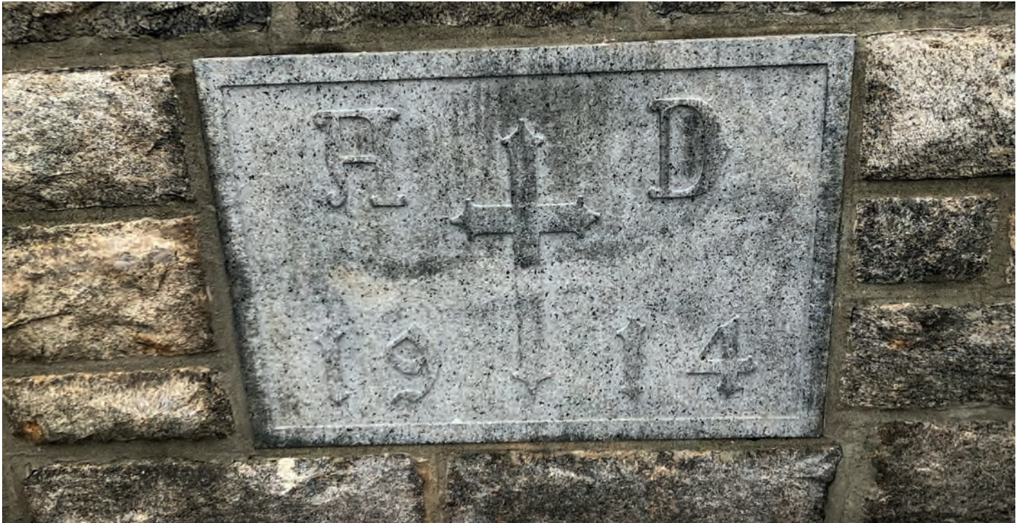
AD on cornerstone stands for Anni Domini- year of the Lord