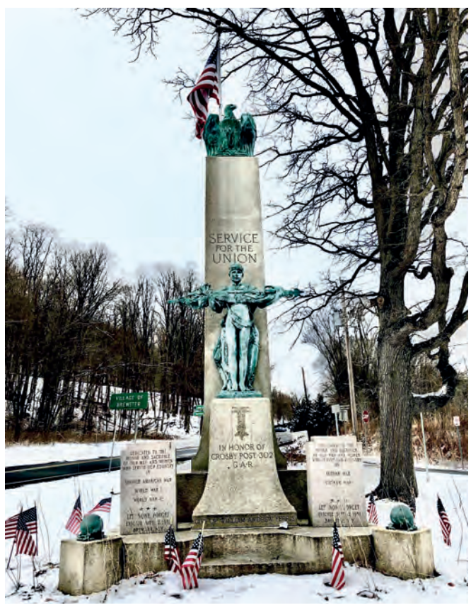
Memorial at Southeast Veternans Park

In 1934, Brewster witnessed the unveiling of the World War I monument at the Electrazone Field. Today, a monument stands in Southeast Veterans Park (formerly the Electrazone Field) dedicated to the individuals who served our country in several wars. On Memorial Day and Veterans Day, services are held, attended by priests of St. Lawrence.