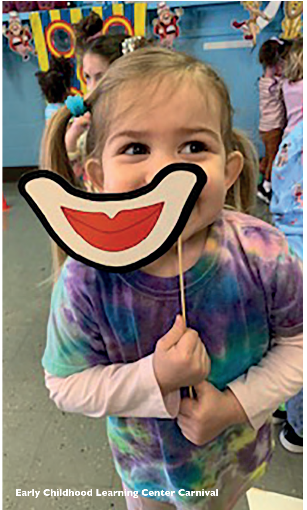
Early Childhood Learning Center Carnival