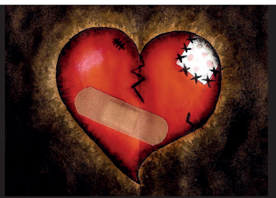
UNLESS YOU FORGIVE EACH OTHER FROM THE HEART

Forgiveness, Reconciliation, and Healing as our path in Lent.