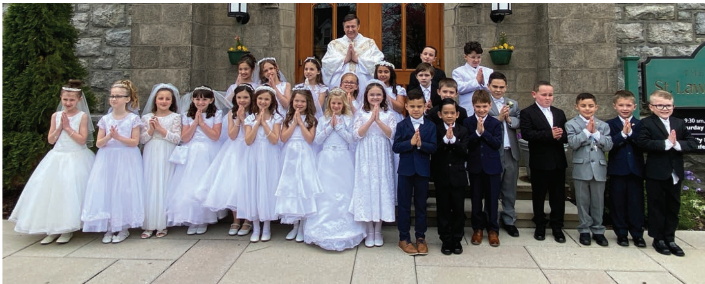
St. Lawrence O'Toole First Holy Communion on May 7, 2022, 11 am