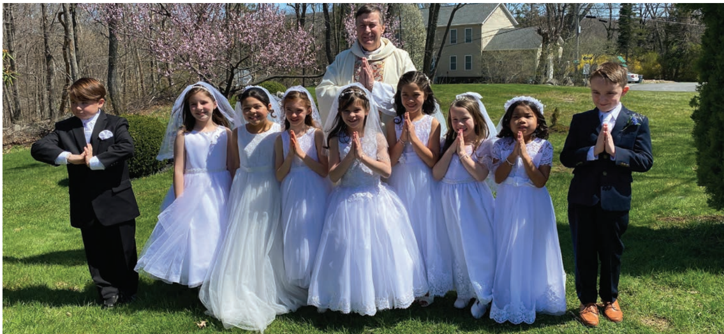
Sacred Heart First Holy Communion on April 23, 2022