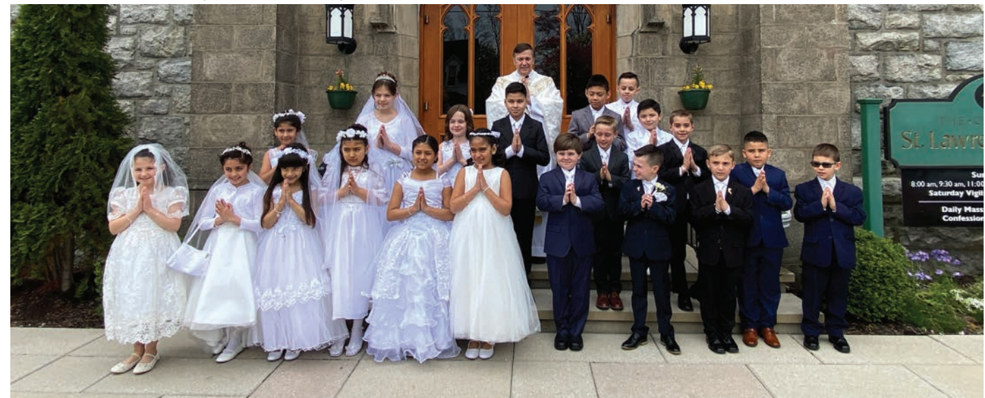
St. Lawrence O'Toole First Holy Communion on May 7, 2022, 1 pm