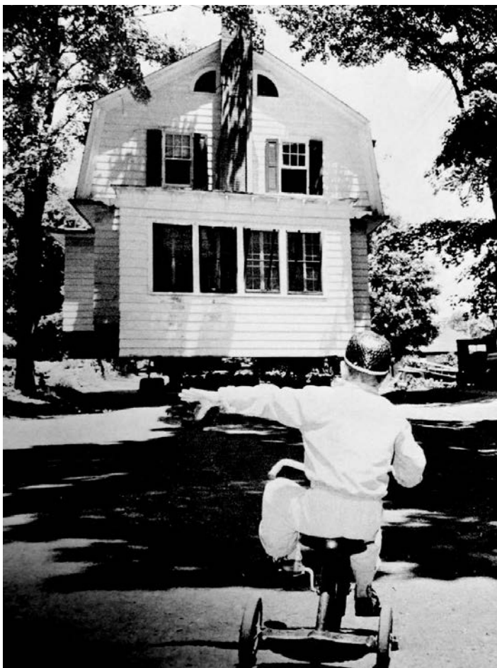
Ganung house being moved to make room for the third and final expansion of our school.