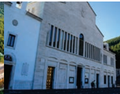
San Giovanni Rotondo