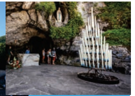
Lourdes Grotto, France