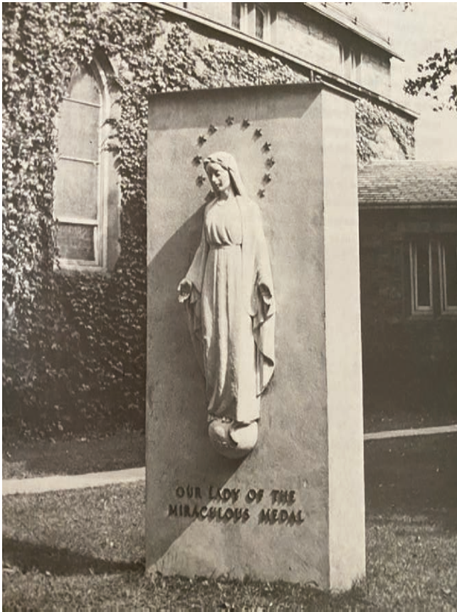
Our Lady of the Miraculous Medal Statue