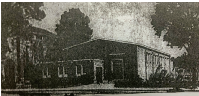
Initial plan for new Auditorium, later revised.