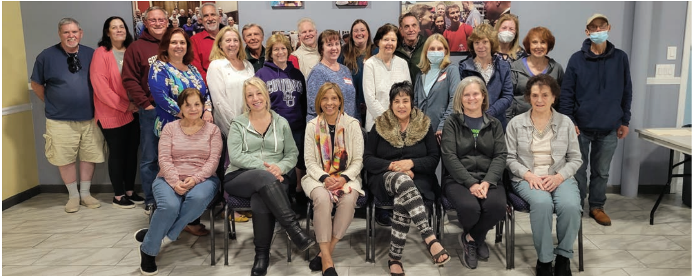
St. Lawrence O'Toole Search