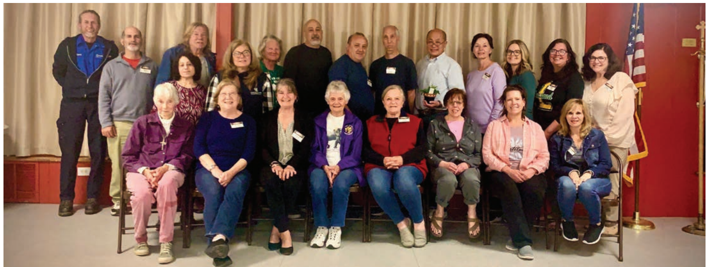
Sacred Heart Search