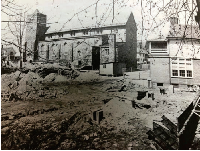
Construction of 1960 St. Lawrence O'Toole's school addition begins