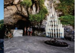
Lourdes Grotto, France