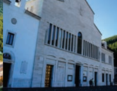
San Giovanni Rotondo