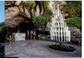
Lourdes Grotto, France