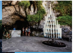
Lourdes Grotto, France