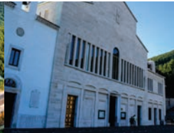
San Giovanni Rotondo