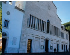
San Giovanni Rotondo