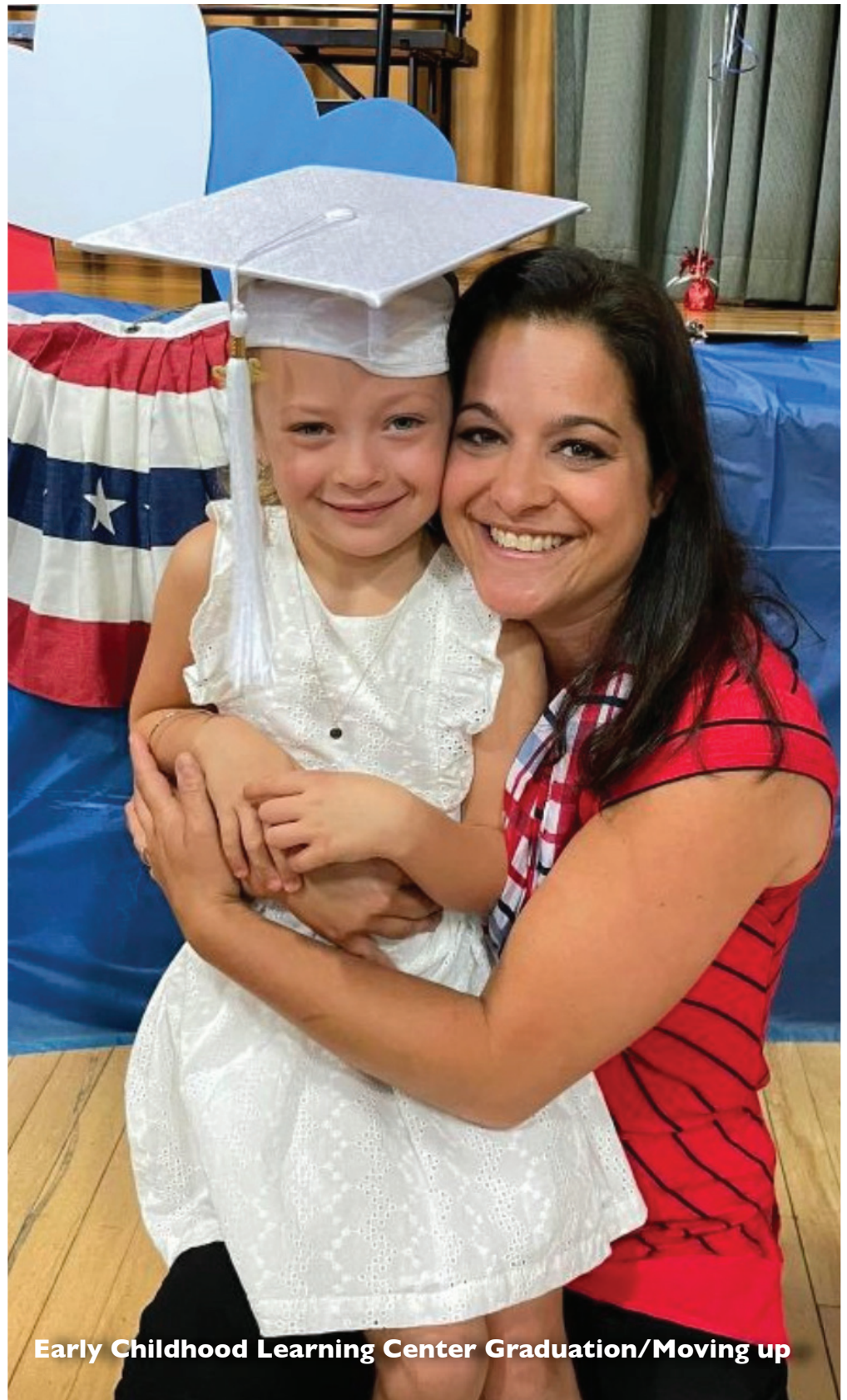
Early Childhood Learning Center Graduation/Moving up