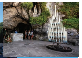
Lourdes Grotto, France