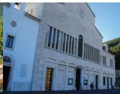
San Giovanni Rotondo