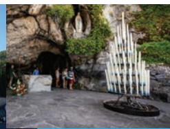
Lourdes Grotto, France