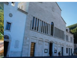
San Giovanni Rotondo