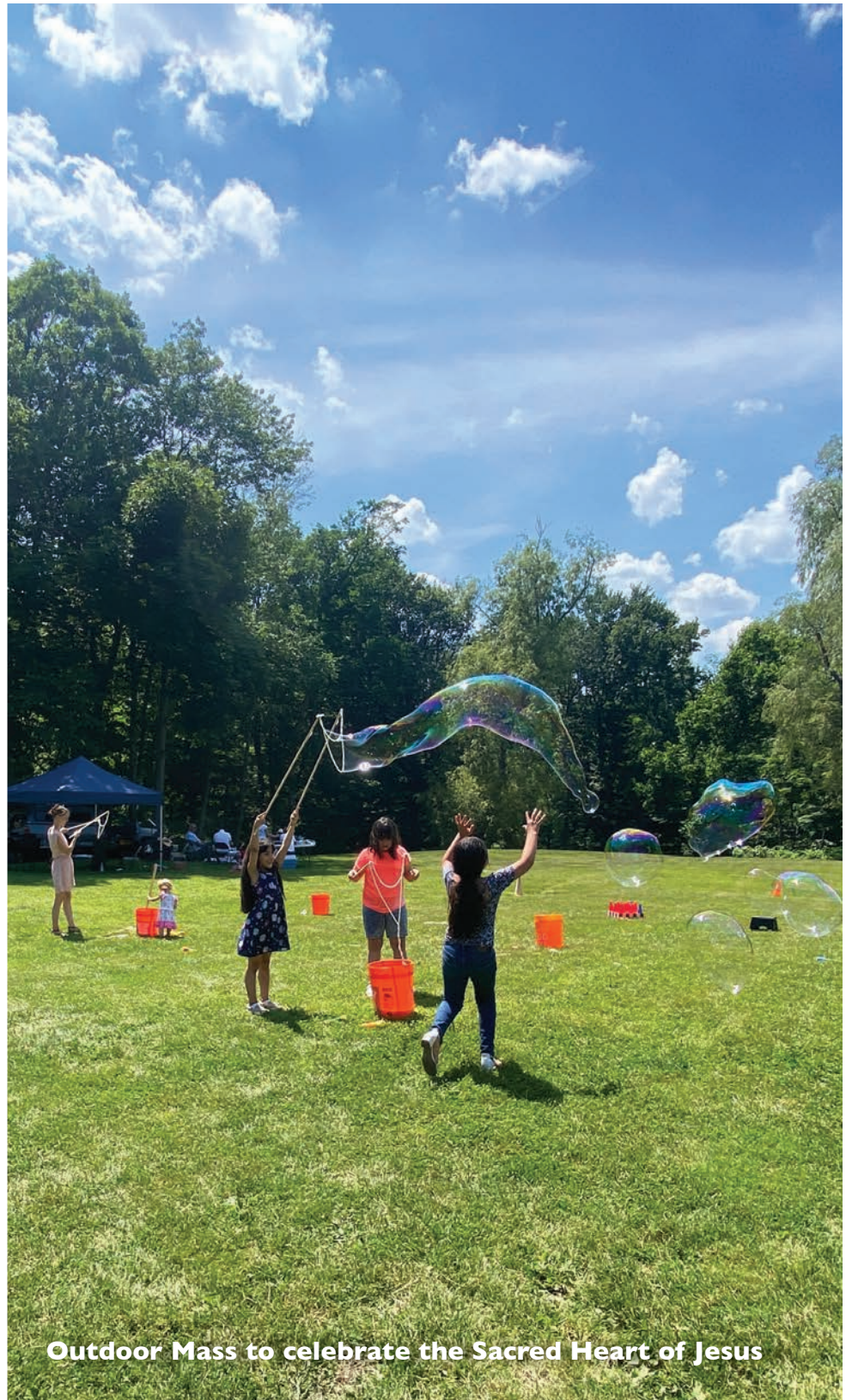
Outdoor Mass to celebrate the Sacred Heart of Jesus