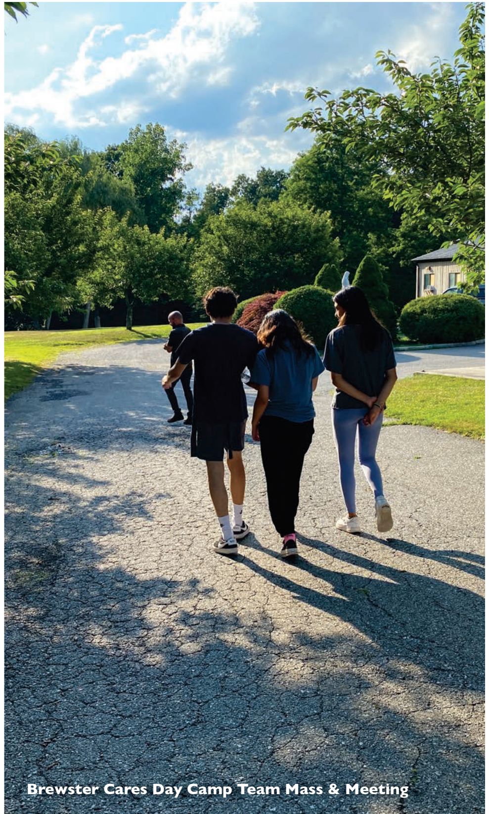
Brewster Cares Day Camp Team Mass & Meeting