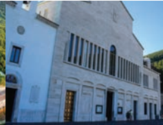
San Giovanni Rotondo