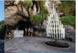
Lourdes Grotto, France