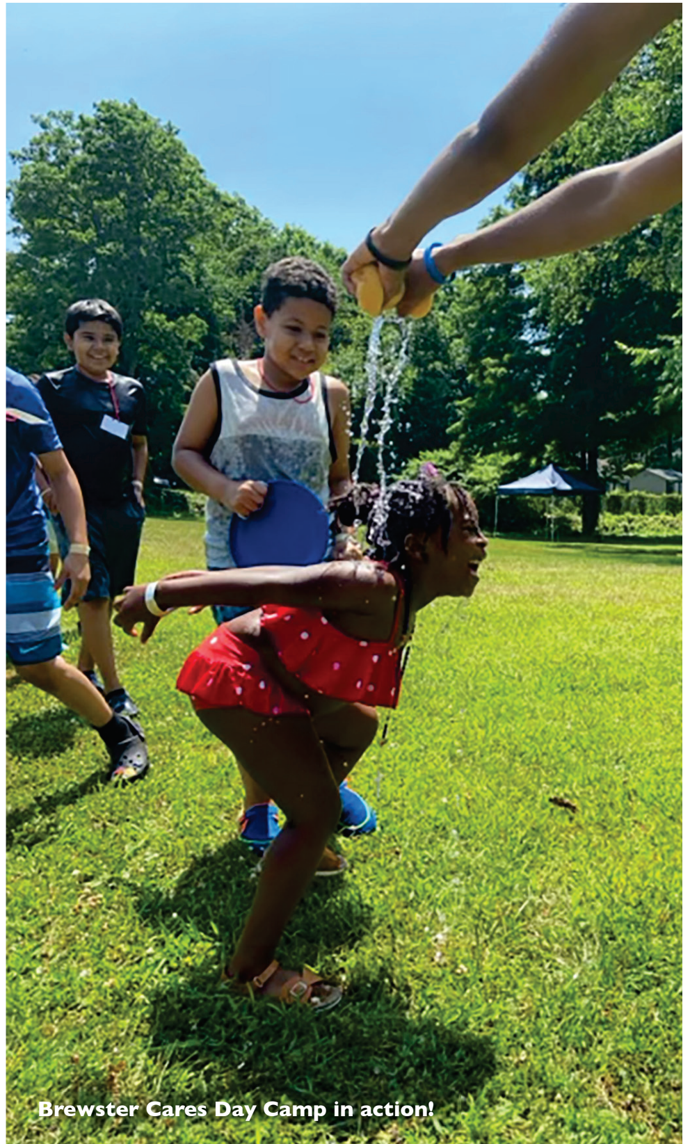
Brewster Cares Day Camp in action!