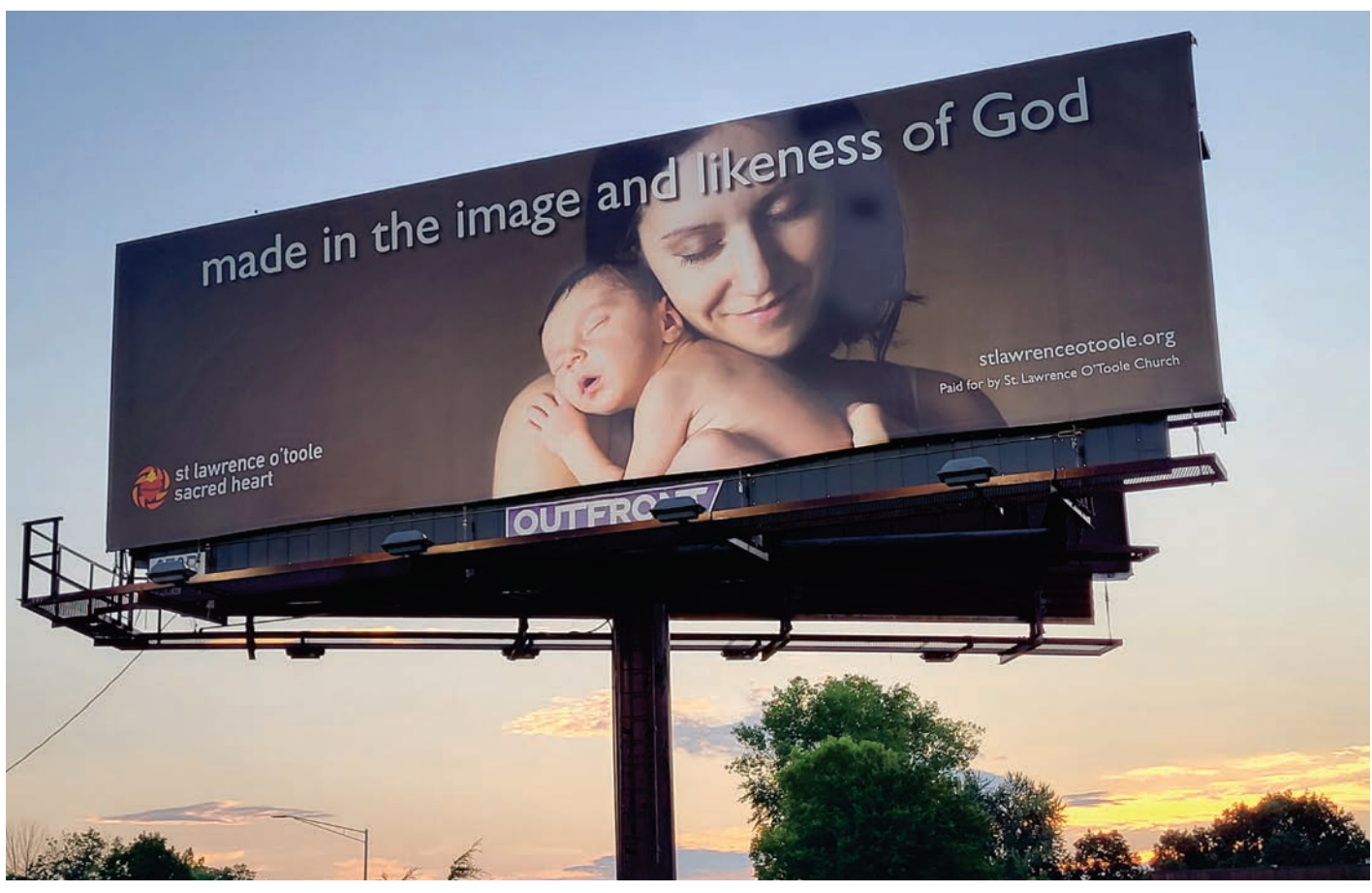
Keep an eye out when traveling west bound on I-84 exit 2 for our Right to Life billboard.