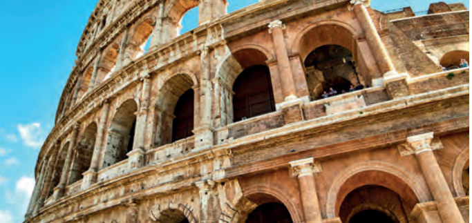
Have questions about this pilgrimage? Ask us! Go to Unitours.com/questions To book online go to https://bit.ly/GillPilgrimage