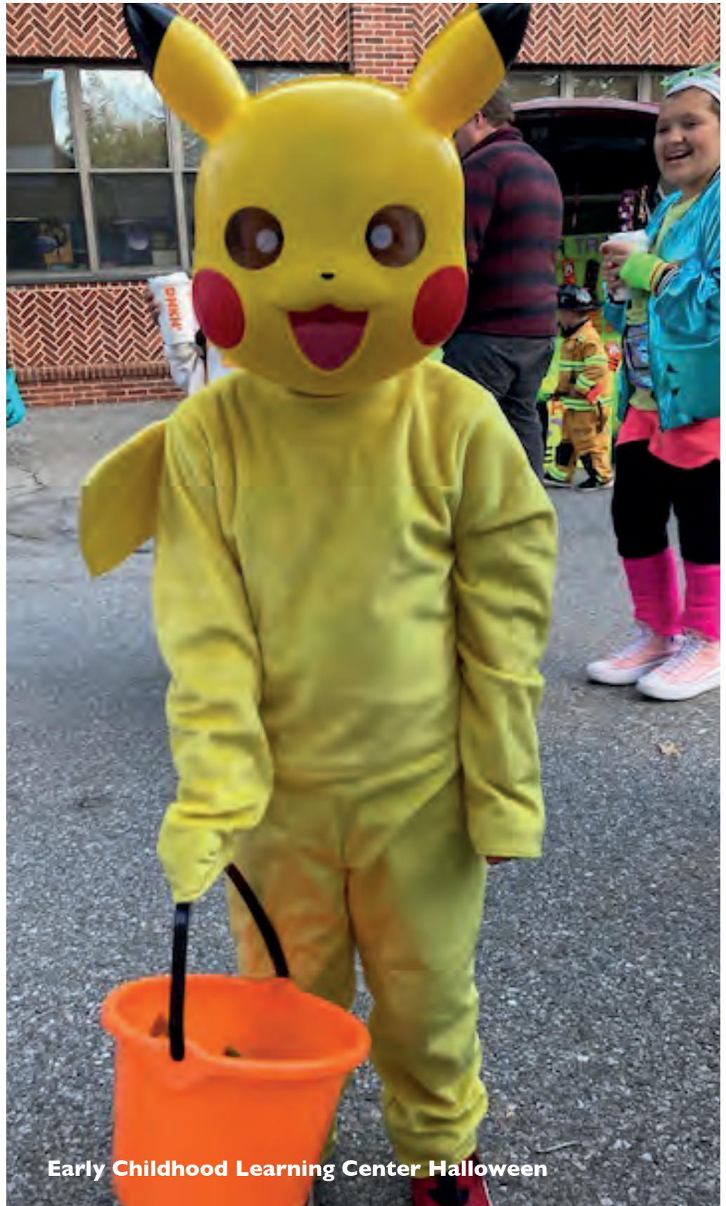
Early Childhood Learning Center Halloween