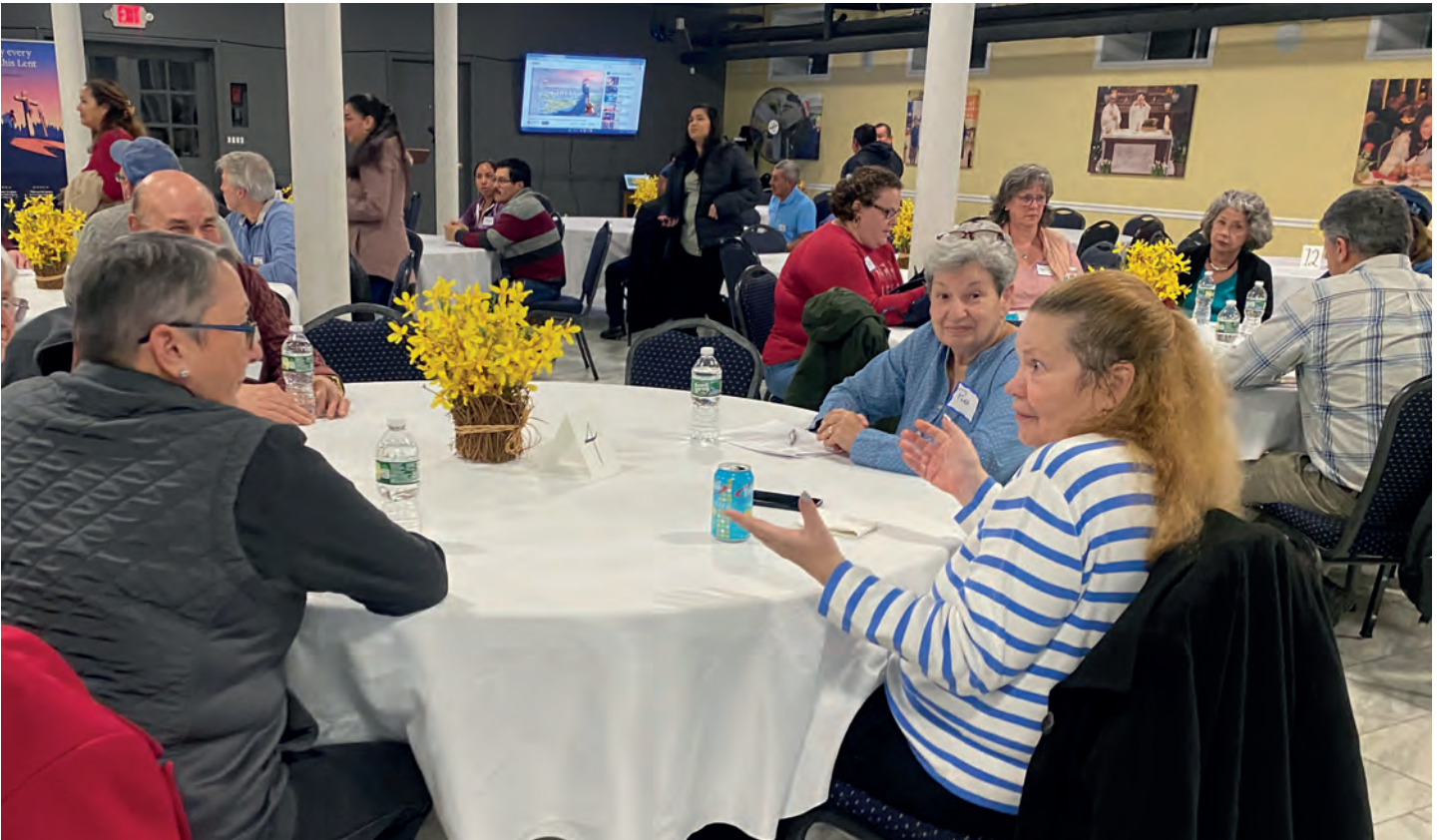
St. Lawrence O'Toole Alpha