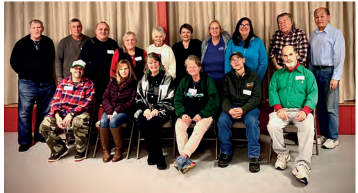
Sacred Heart Alpha

Recently, I returned to my Catholic faith at St. Lawrence O'Toole parish. The Alpha program has brought me closer to my faith as well as a stronger connection to God. The program is comforting and gives the opportunity to meet new people, listen to feedback, and share with one another. I have looked forward to going every week!