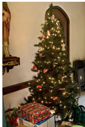
St. Lawrence O’Toole Gift Tree

Again, thank you to the many people who contributed. Your generosity does not go unnoticed and it has many far reaching benefits.