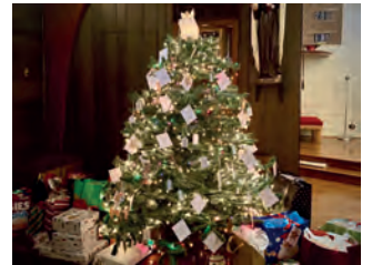
Sacred Heart Gift Tree

For there will never cease to be poor in the land. Therefore I command you, “You shall open wide your hand to your brother, to the needy and to the poor, in your land.” (Deuteronomy 15:11)