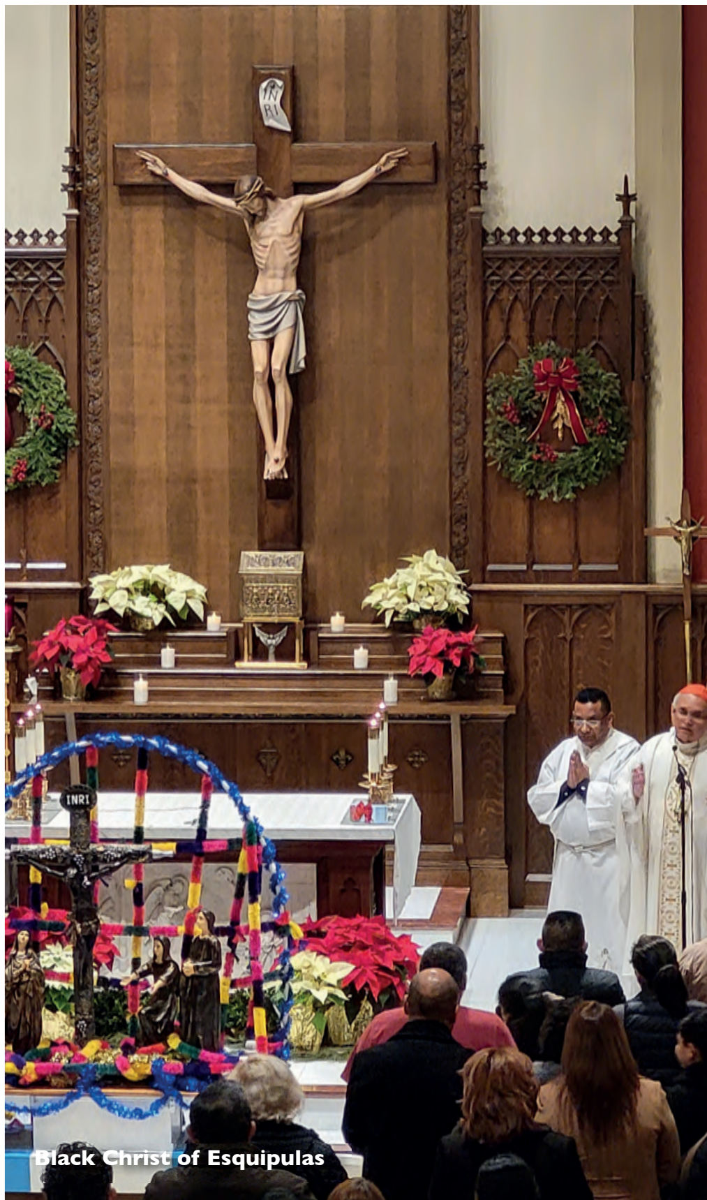
Black Christ of Esquipulas