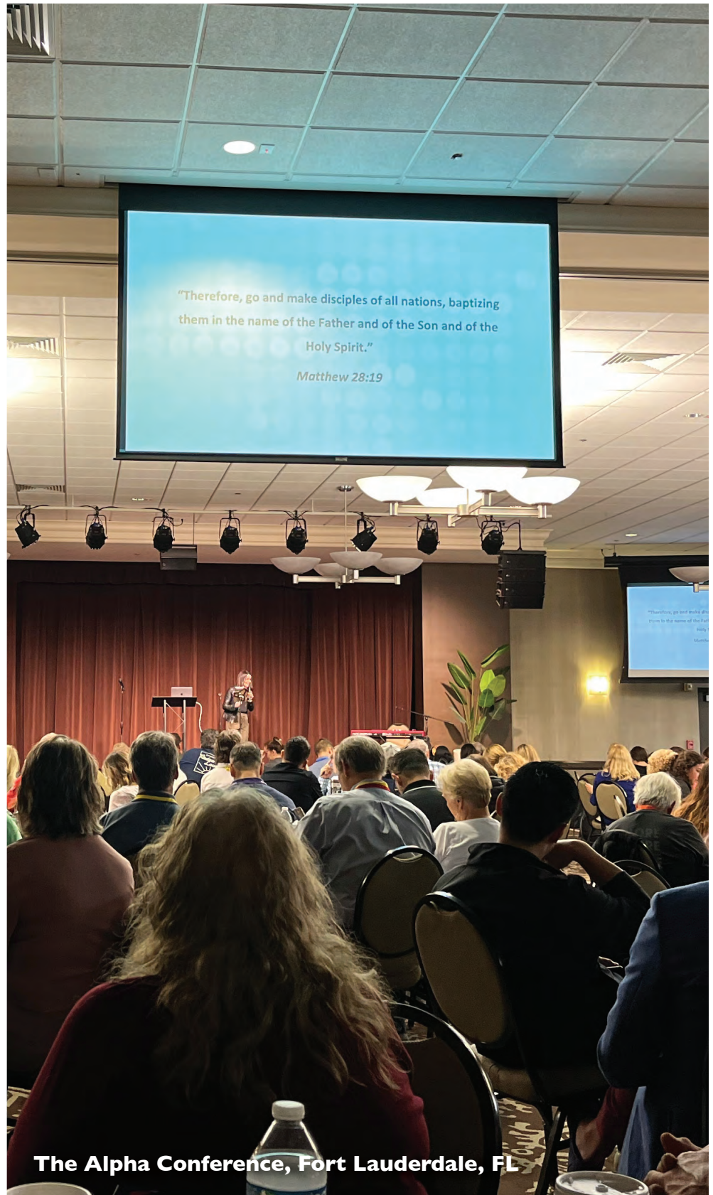
The Alpha Conference, Fort Lauderdale, FL