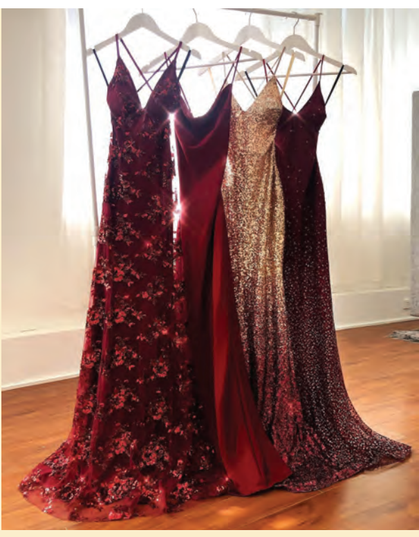
This fundraising event is sponsored by the Catholic Daughters Our Lady of the Lake Court #2585, Patterson, NY

March 5 11:30 AM ~ 1:30 PM Sacred Heart Church Hall March 8, 9, & 10 5:00 PM ~ 8:00 PM Sacred Heart Gym