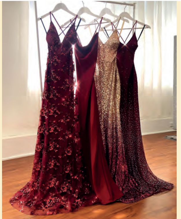
This fundraising event is sponsored by the Catholic Daughters Our Lady of the Lake Court #2585, Patterson, NY