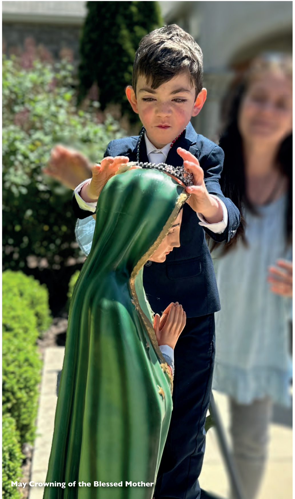
May Crowning of the Blessed Mother