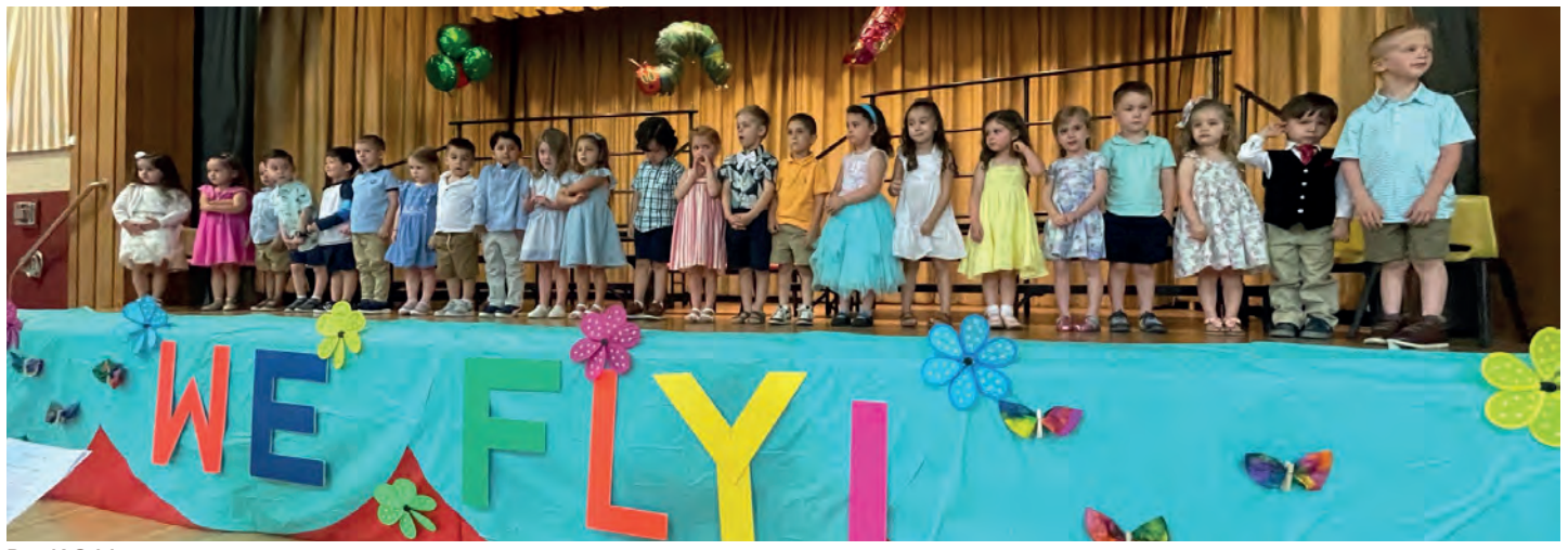
Pre-K 3 Moving up ceremony