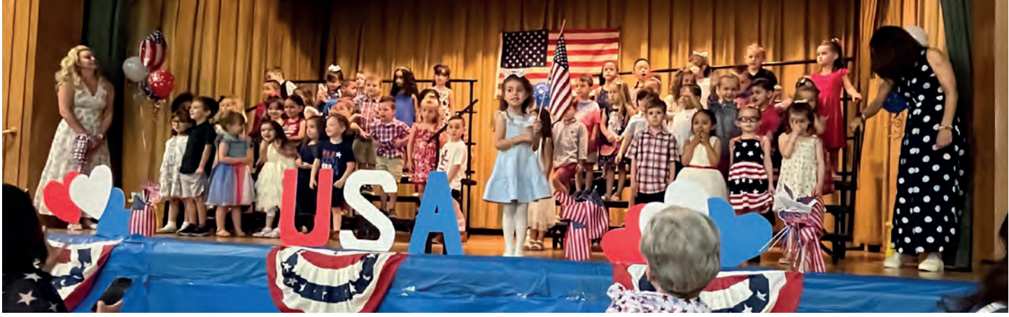
Pre-K 4 Graduation ceremony