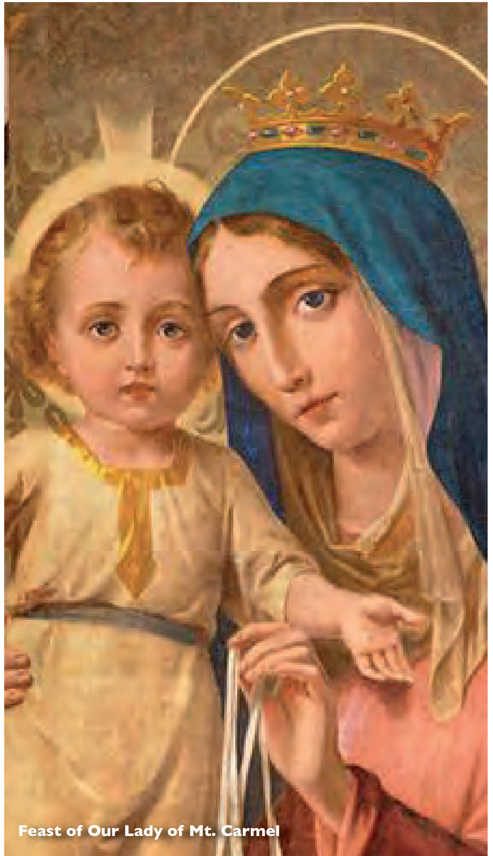
Feast of Our Lady of Mt. Carmel