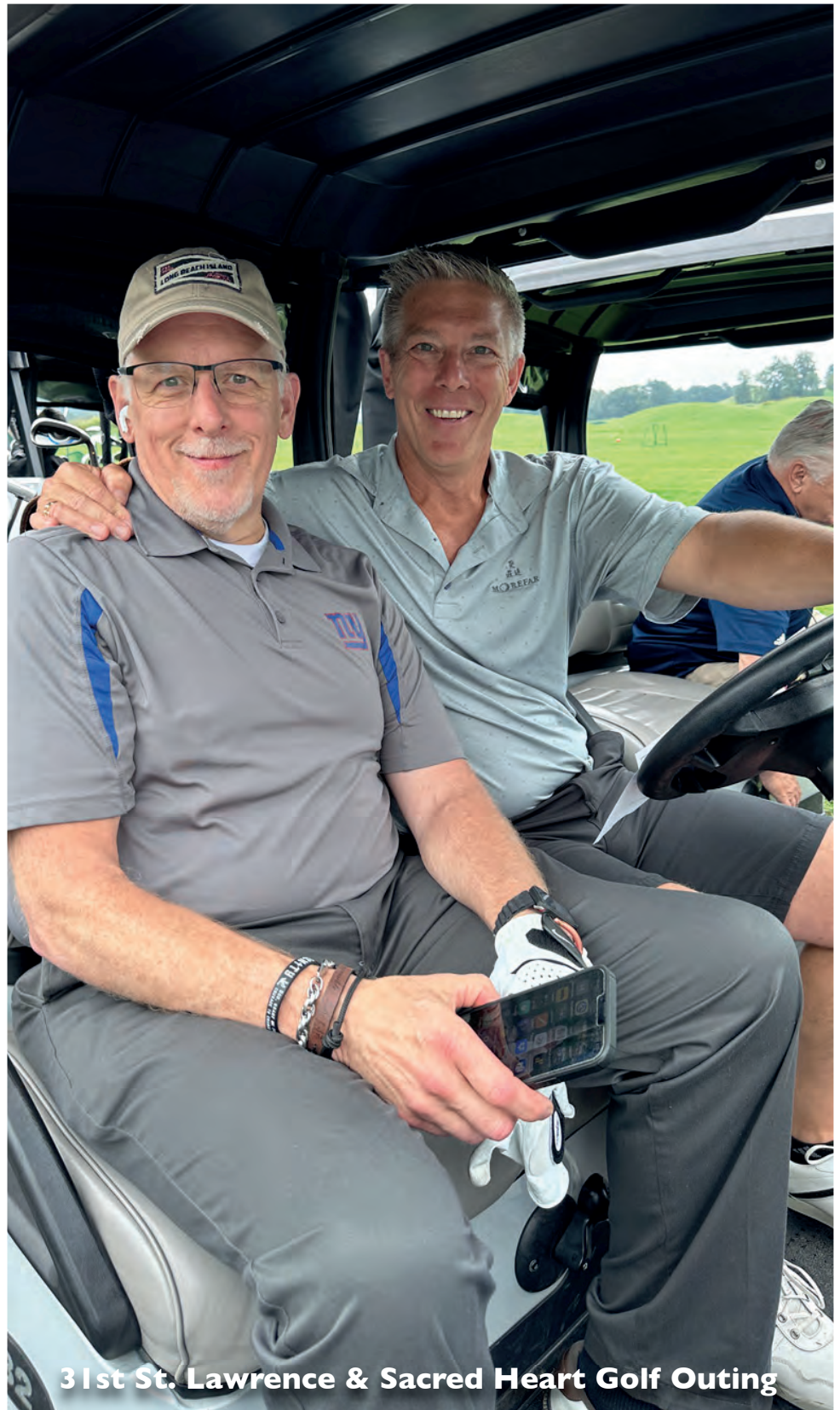
31st St. Lawrence & Sacred Heart Golf Outing