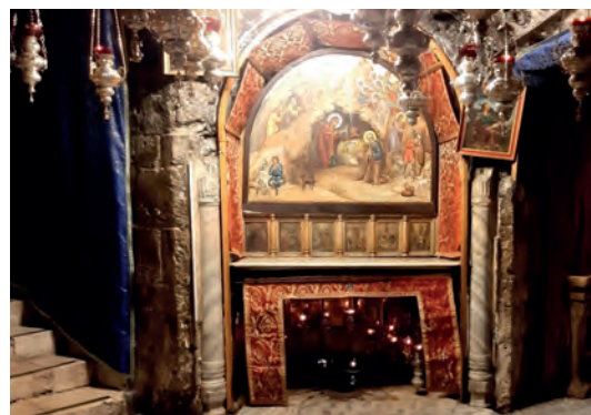
Site where Christ was born in the Church of the Nativity, Bethlehem

The LORD is a stronghold for the oppressed, a stronghold in times of trouble. Those who know your name trust in you; you never forsake those who seek you, LORD.