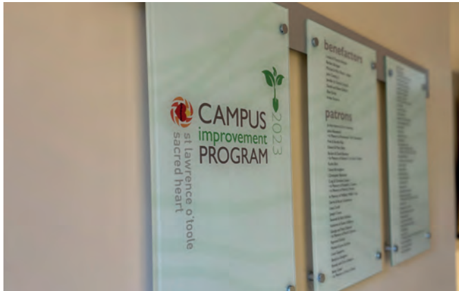
Blessing of the Donor Board for the Campus Improvement Program at St. Lawrence on Sunday, Nov. 26