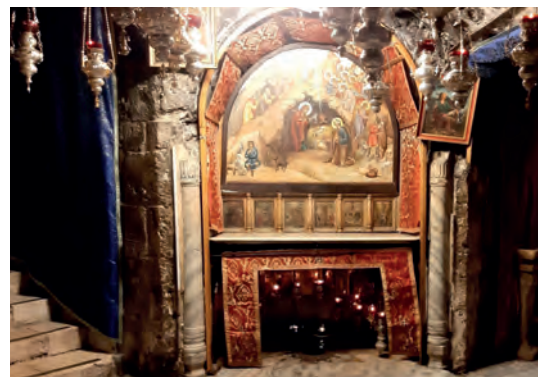
Site where Christ was born in the Church of the Nativity, Bethlehem

The LORD is a stronghold for the oppressed, a stronghold in times of trouble. Those who know your name trust in you, you never forsake those who seek you, LORD.