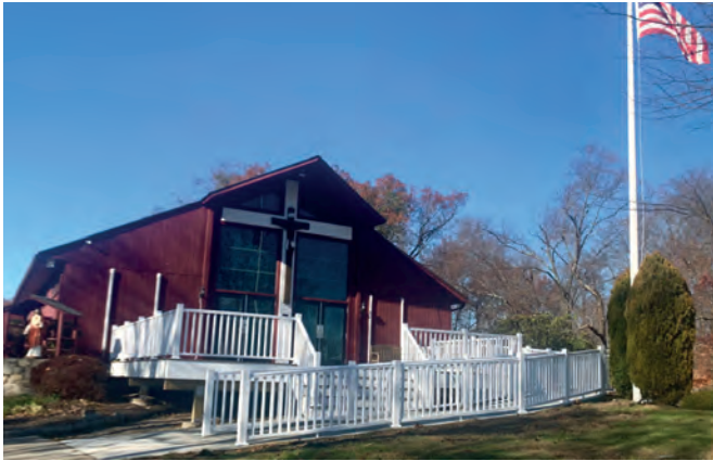
Sacred Heart Church Improvement Program—Front deck is completed.