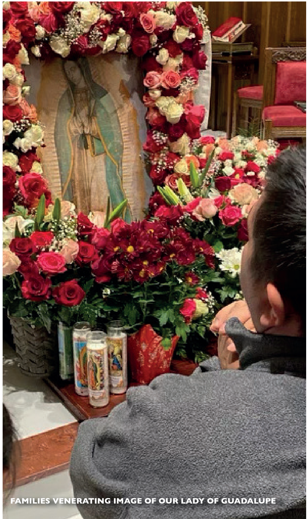
FAMILIES VENERATING IMAGE OF OUR LADY OF GUADALUPE