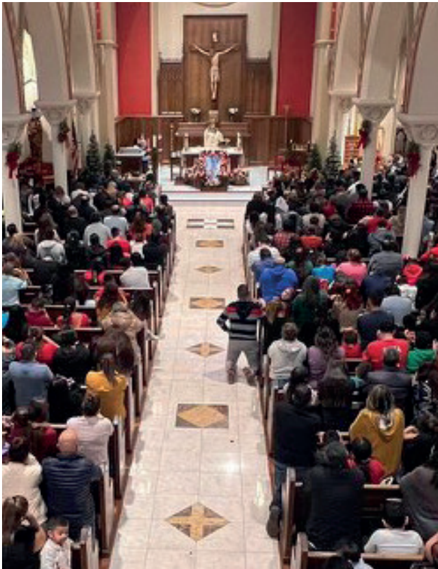
Our Spanish community celebrating the Feast of Our Lady of Guadalupe.